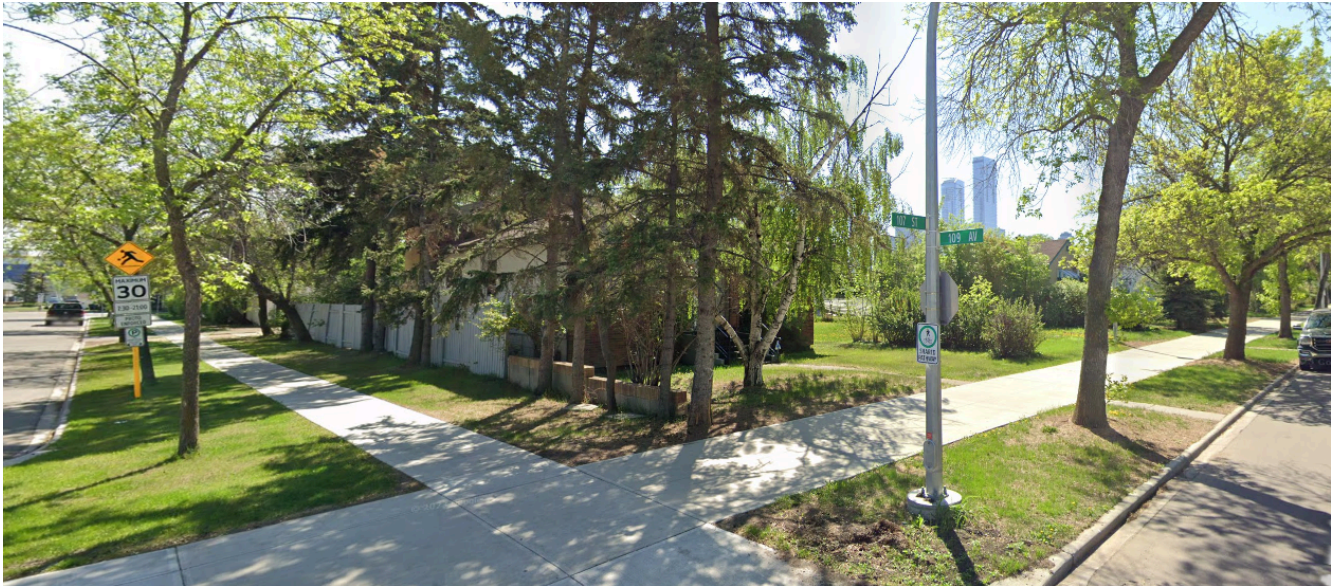
View of the site from the northwest at the intersection of 109 Avenue NW and 107 Street NW