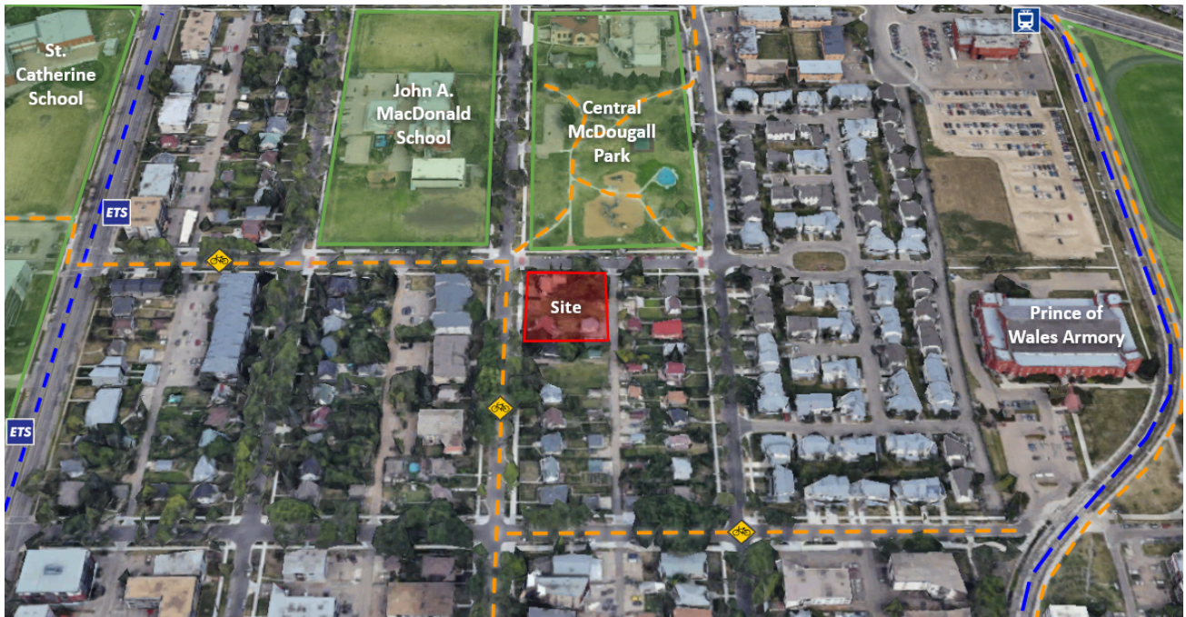
Site analysis context