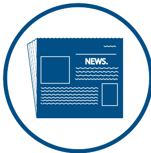
JOURNAL AD Jan 11 & 15, 2025