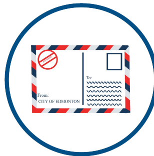
PUBLIC HEARING NOTICE Dec 19, 2024