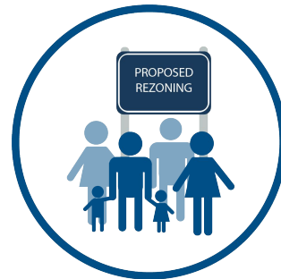
SITE SIGNAGE July 30, 2024