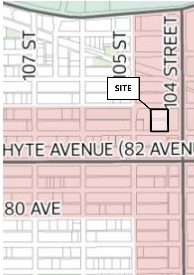
SCONA DISTRICT PLAN - Map 3: Nodes and Corridors