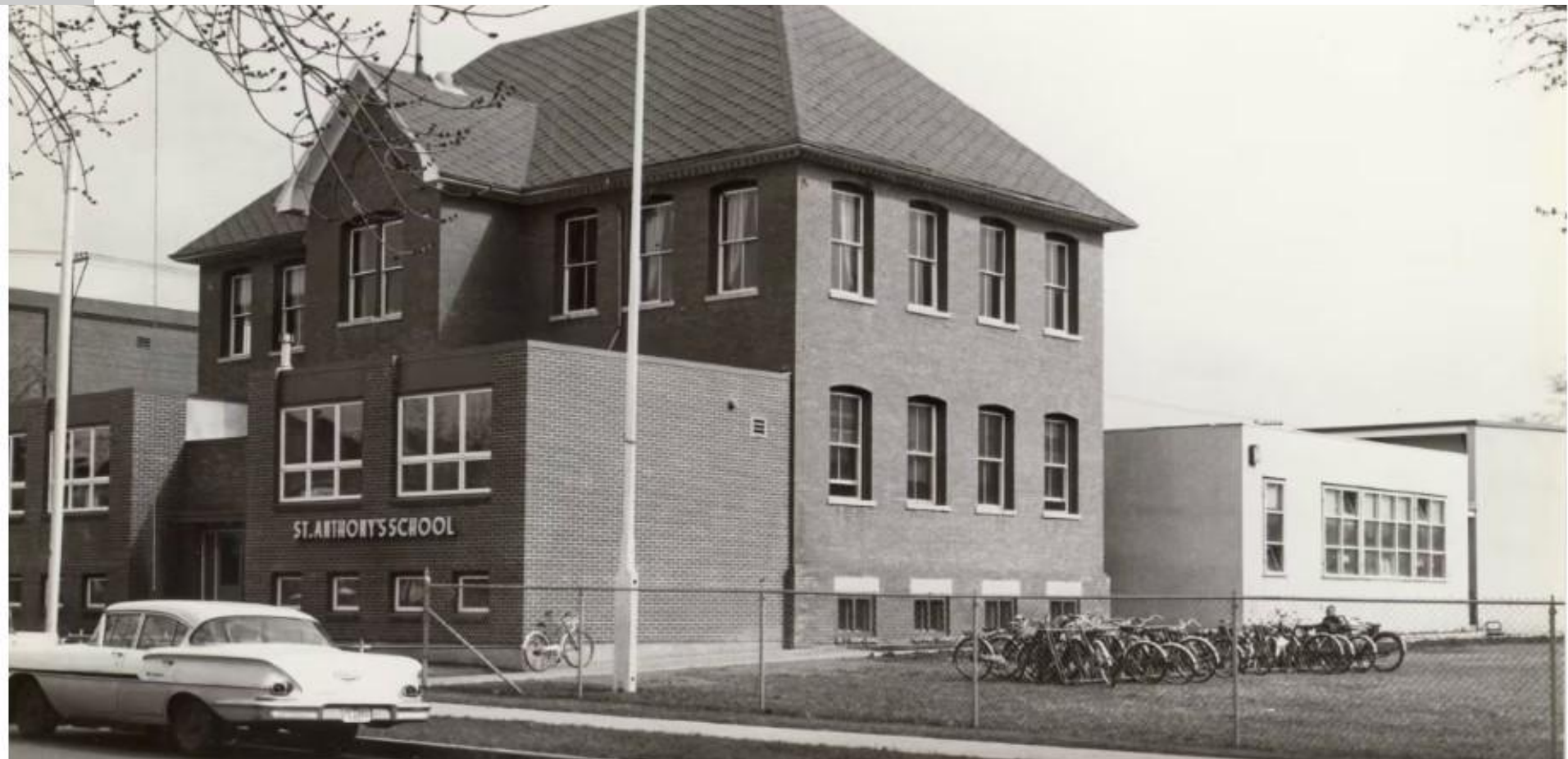
St. Anthony School in the 1960s