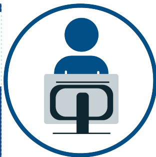
CITY WEBPAGE June 26, 2024