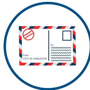
PUBLIC HEARING NOTICE December 19, 2024