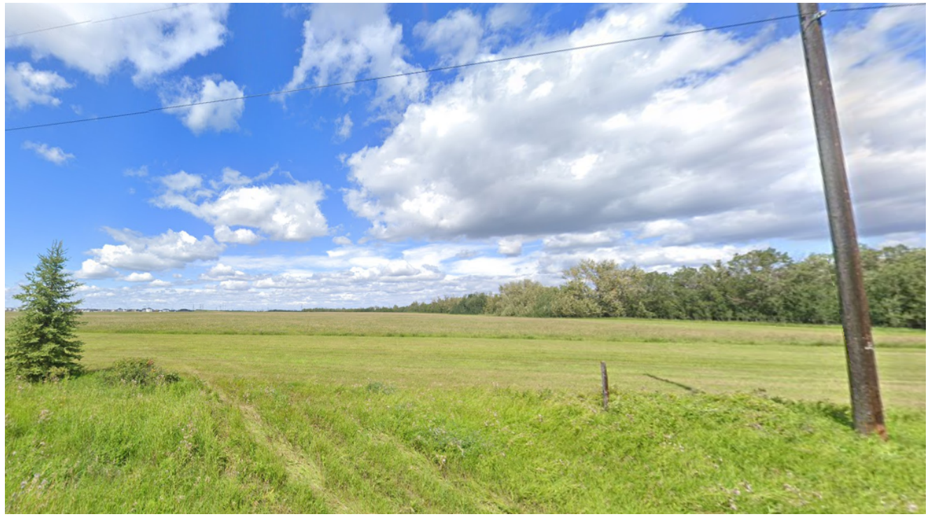
View of the rezoning area from 17 Avenue NW, looking north.