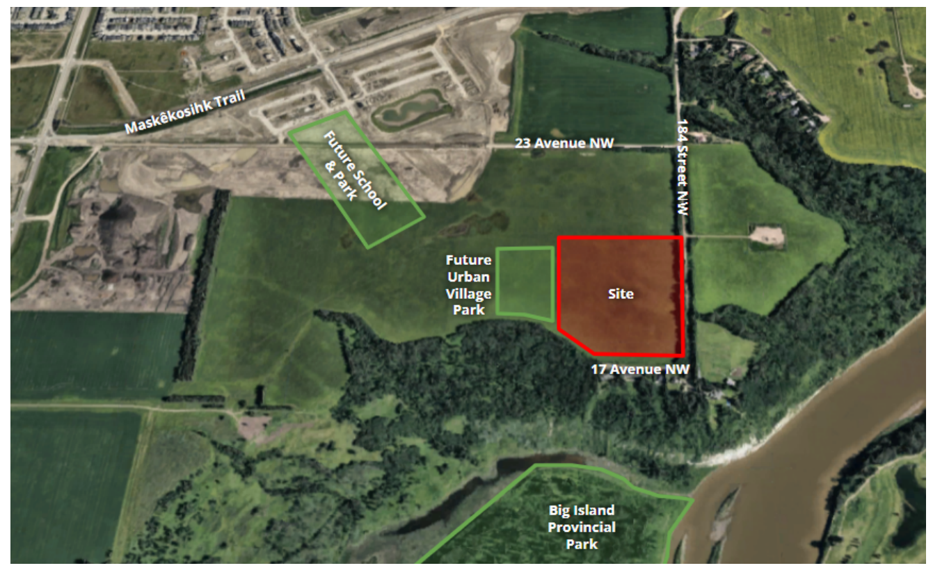
Site analysis context