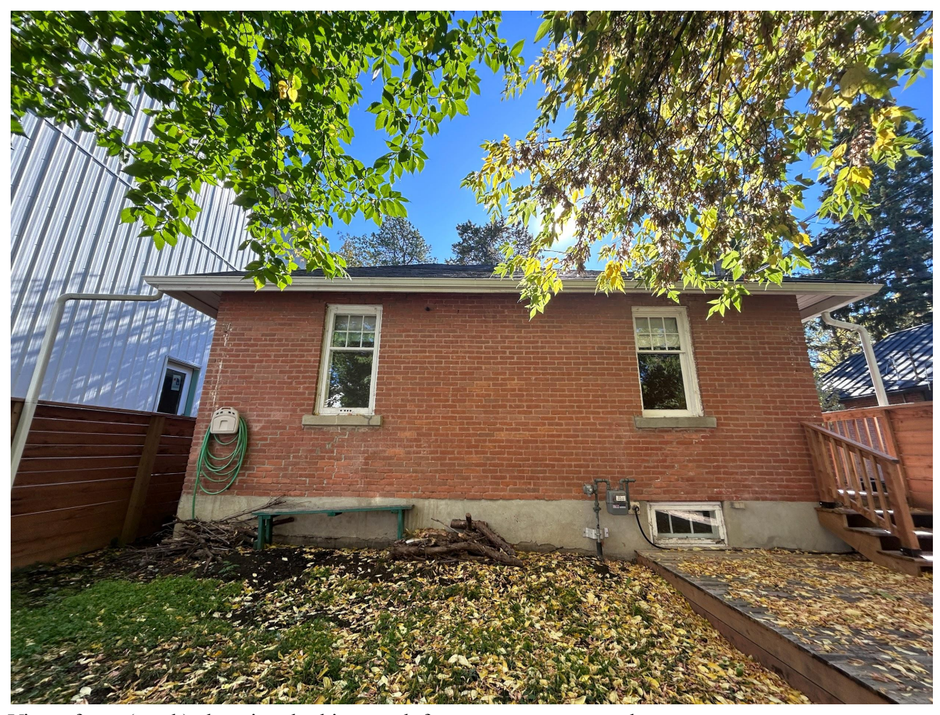
View of rear (north) elevation, looking south from property rear yard.