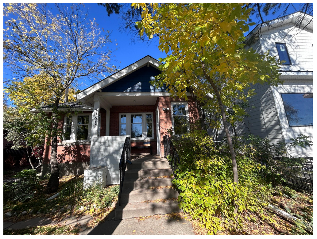
View of front (south) elevation, looking north from 103 Avenue NW.