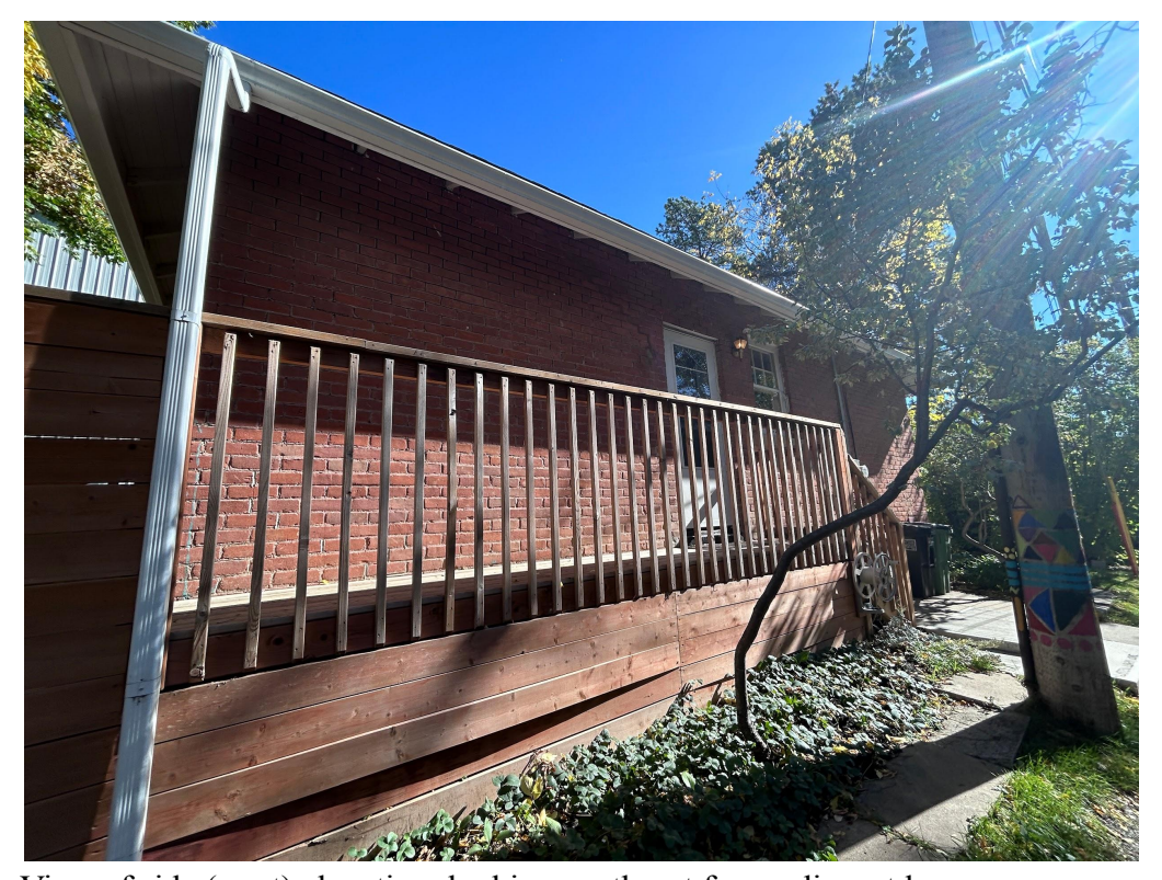
View of side (west) elevation, looking southeast from adjacent lane.