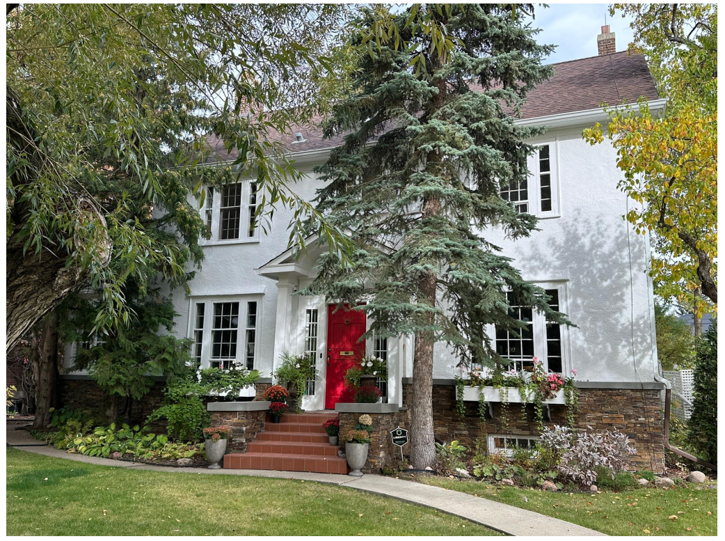
View of front (south) elevation, looking northwest from Connaught Drive NW.