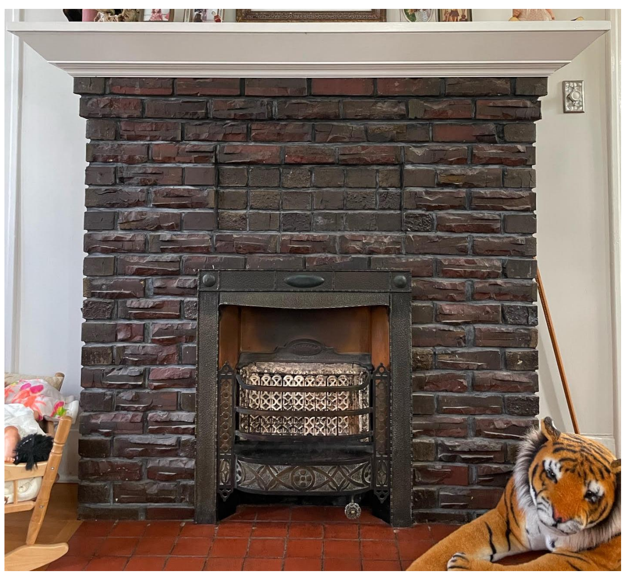
View of clinker brick fireplace.