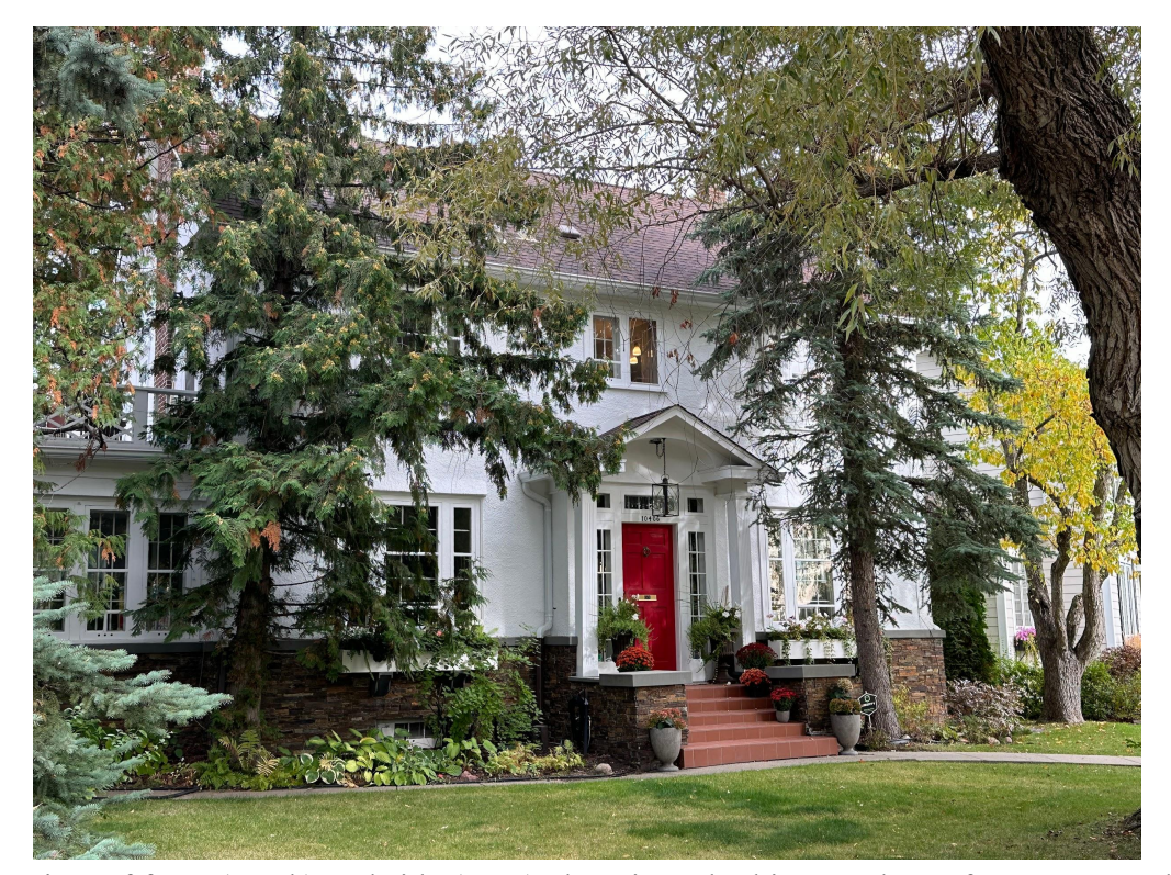
View of front (south) and side (west) elevations, looking northeast from Connaught Drive NW.