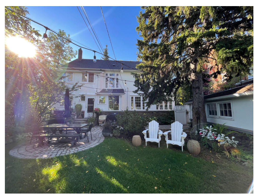
View of rear (north) elevation, looking south from property rear yard.