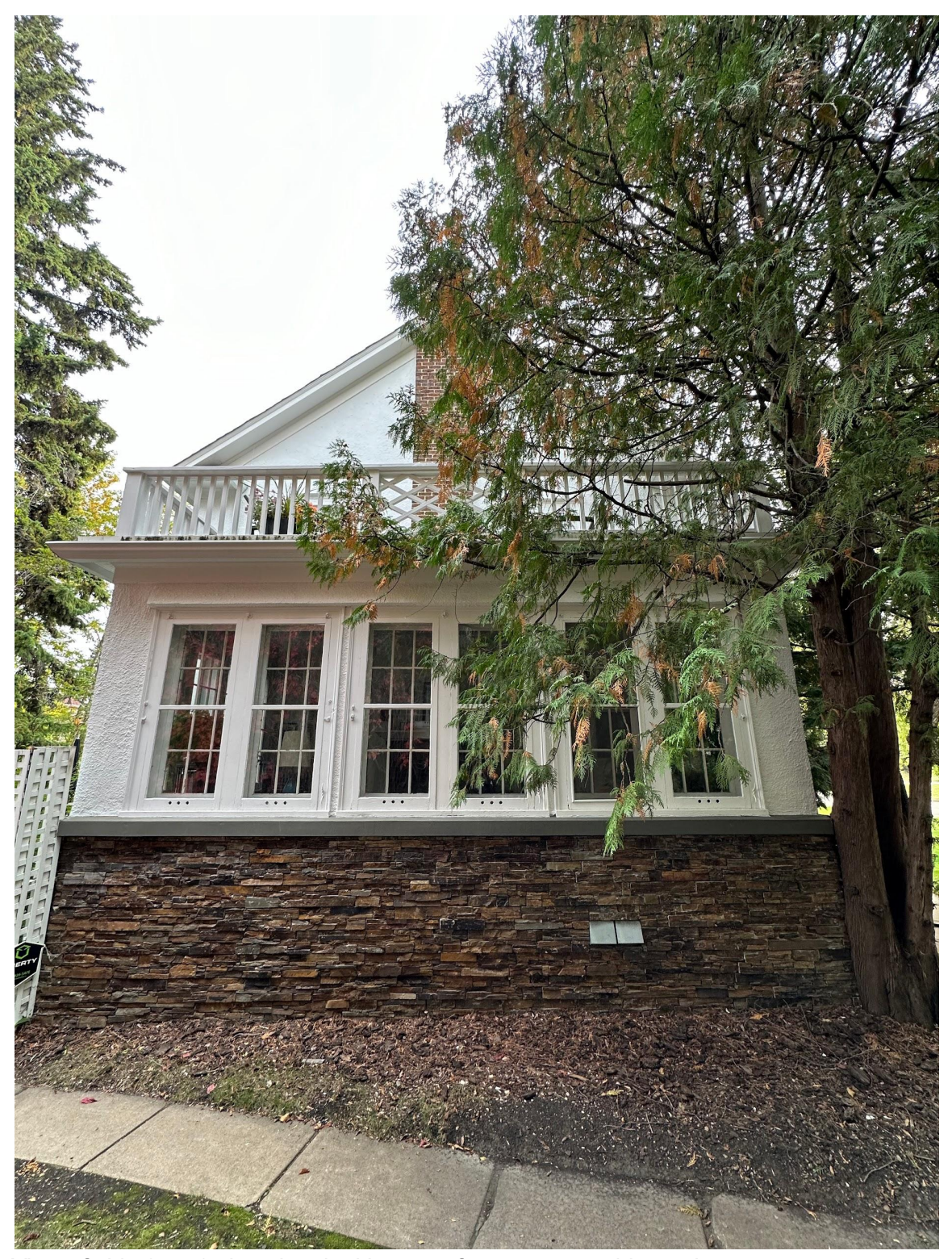
View of side (west) elevation, looking east from property side yard.