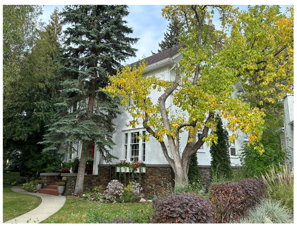
View of front (south) and side (east) elevations, looking northwest from Connaught Drive NW.