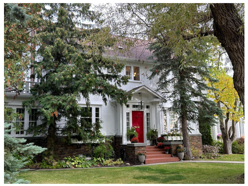
View of front (south) and side (west) elevations, looking northeast from Connaught Drive NW.