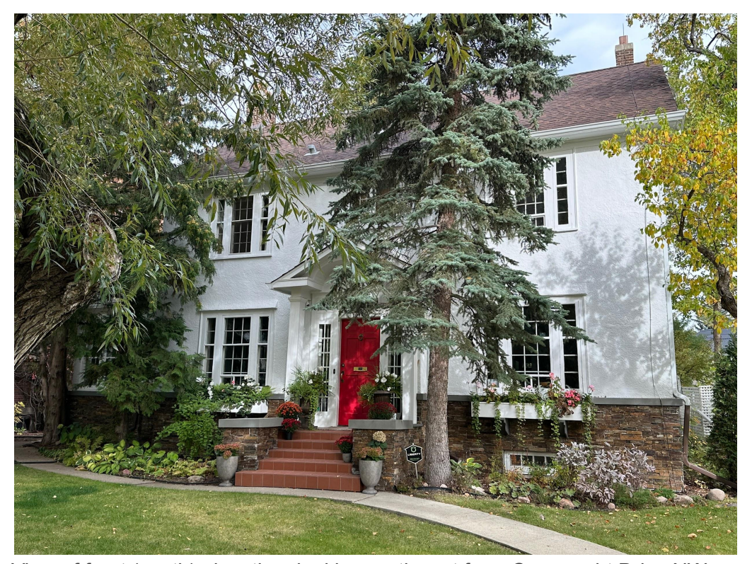
View of front (south) elevation, looking northwest from Connaught Drive NW.