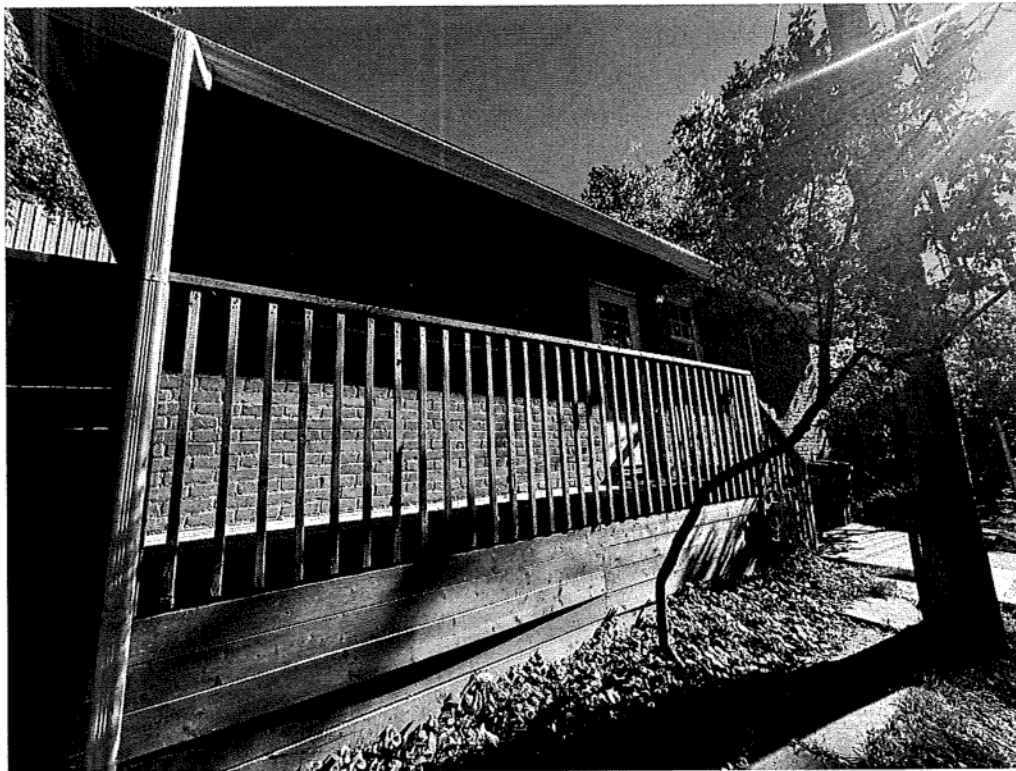
View of side (west) elevation, looking southeast from adjacent lane.