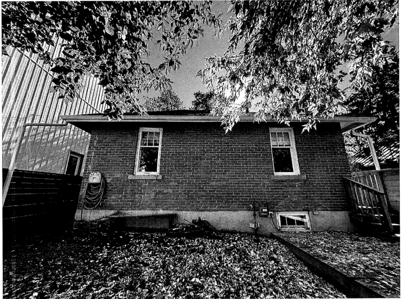
View of rear (north) elevation, looking south from property rear yard.