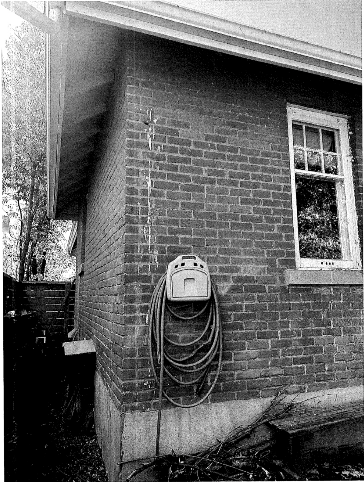
View of side (east) and rear (north) elevations, looking southwest from property side yard.