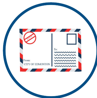
PUBLIC HEARING NOTICE Jan 30, 2025