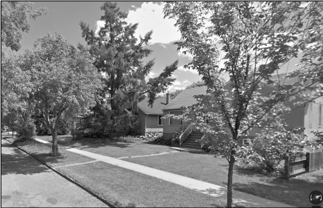
Figure 1 – Subject Site looking east from 84 th Avenue.