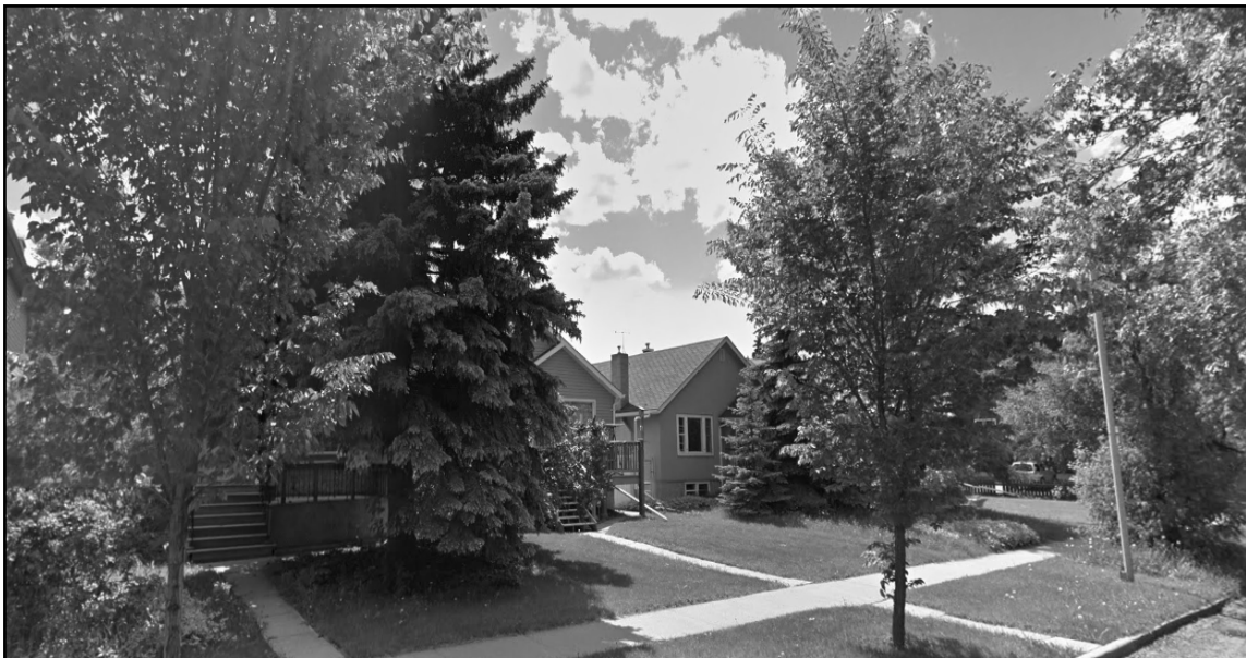
Figure 2 – Subject Site looking west from 84 th Avenue