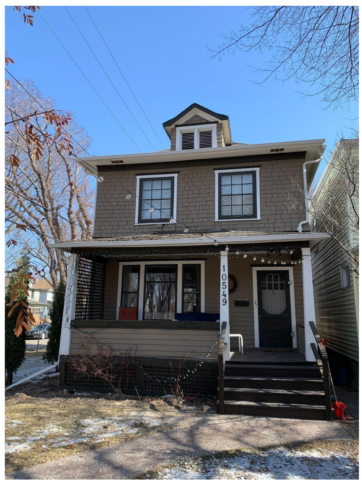
View of west elevation, looking east from 126 Street NW.