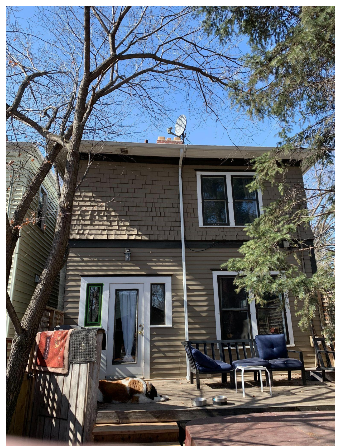
View of east elevation, looking west from property rear yard.