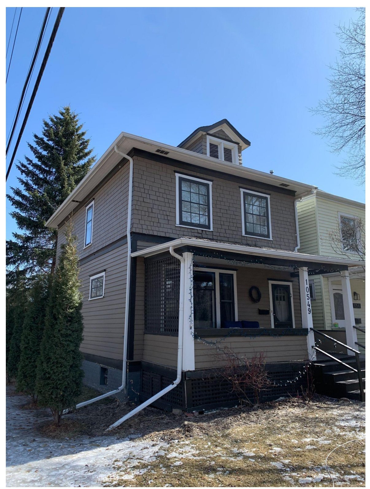
View of west (front) and north (side) elevations, looking southeast from 126 Street NW.