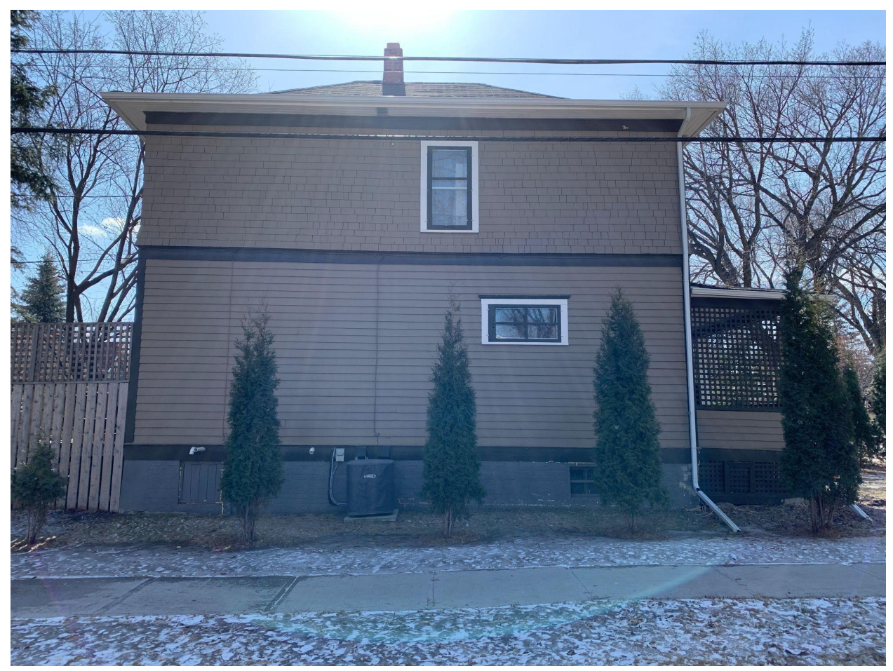
View of north elevation, looking south from 106 Avenue NW.