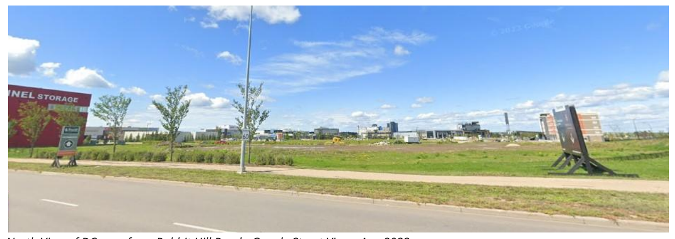
North View of DC area from Rabbit Hill Road - Aug 2023 Attachment 2 | File: LDA24-0461 | Ambleside