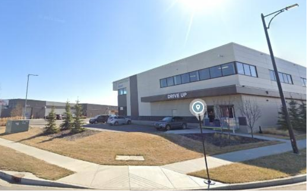
View of Site from intersection of Andrews Gate SW & Allan Drive SW May 2021