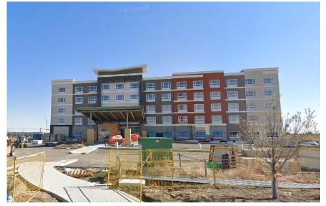
South View of 6125 - ANDREWS LOOP SW - Google Street View - May 2021