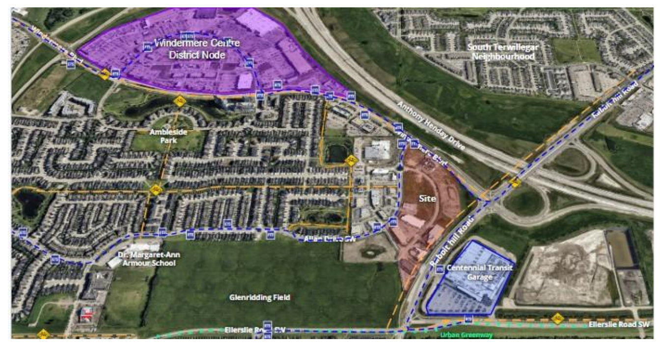
Site analysis context