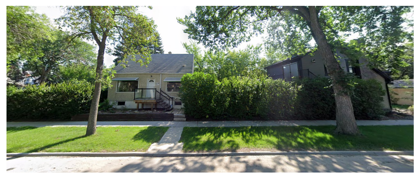
View of the site looking east from 113 Street NW.