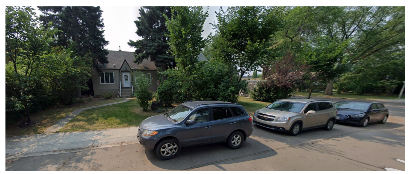
View of the site looking south from 73 Avenue NW.