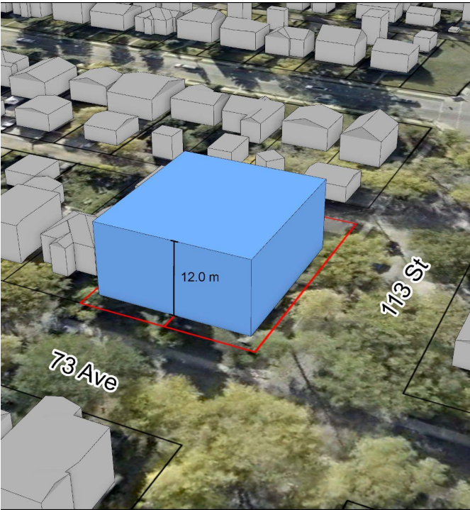
Model #1 - RS Zone (current)