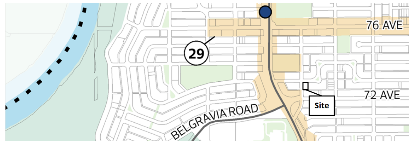
Rezoning site outlined in black shown in proximity to the 114 Street Secondary Corridor, shaded in yellow (Scona District Plan Map 3 - Nodes and Corridors).