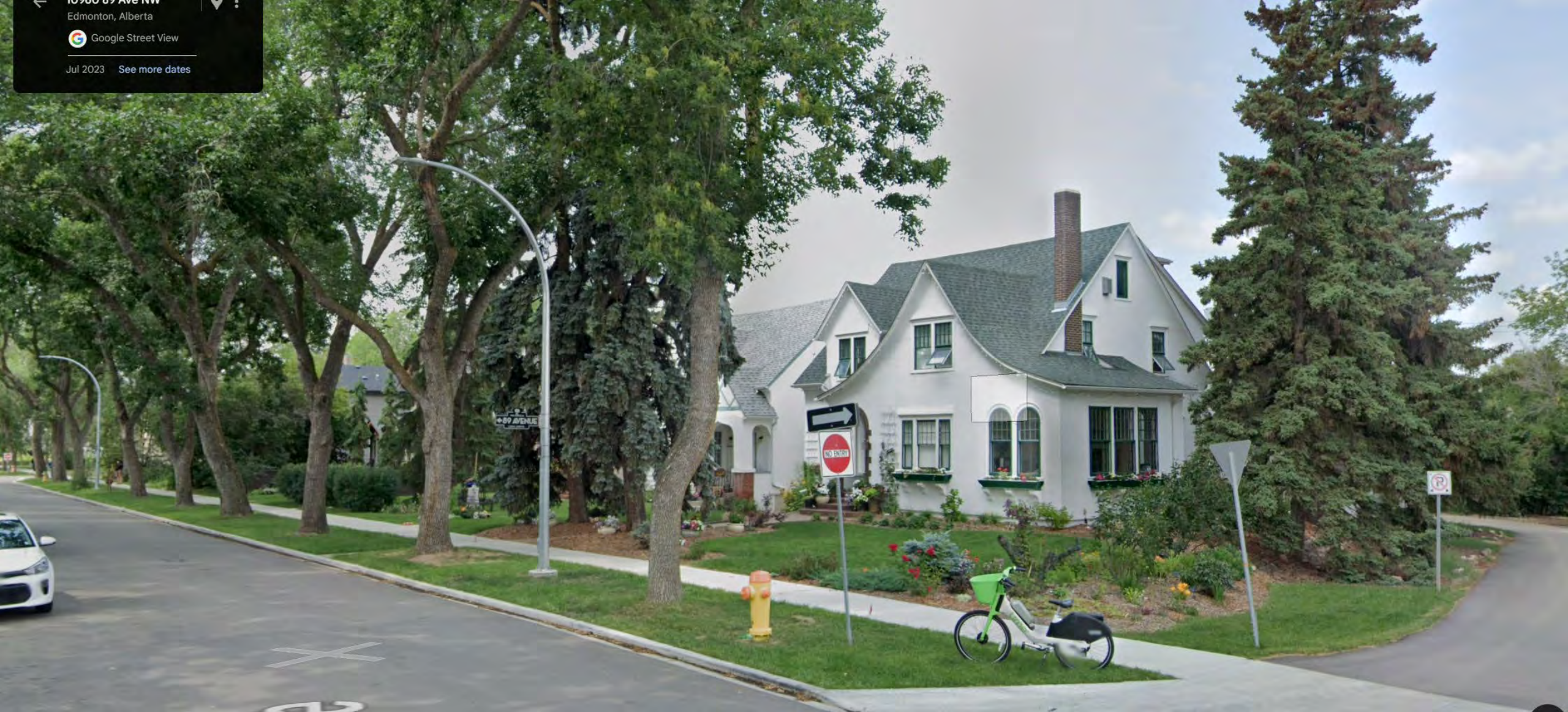
Arriving 89 th Avenue