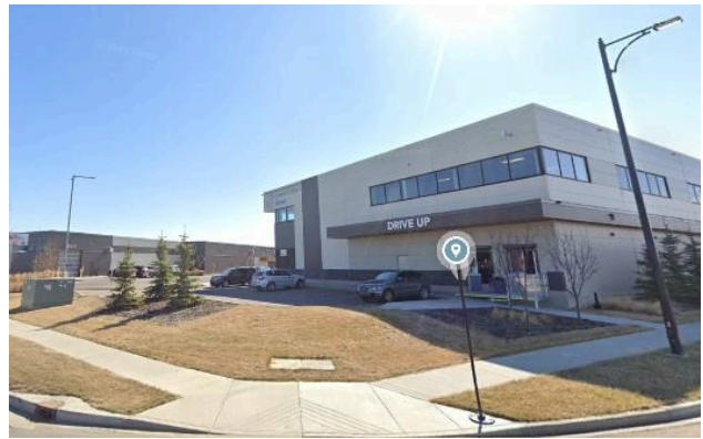
View of Site from intersection of Andrews Gate SW & Allan Drive SW - Google Street View May 2021