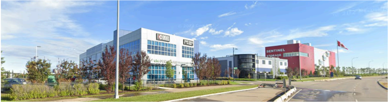
South Corner of DC Area from Rabbit Hill Road - Google Street View Aug 2023