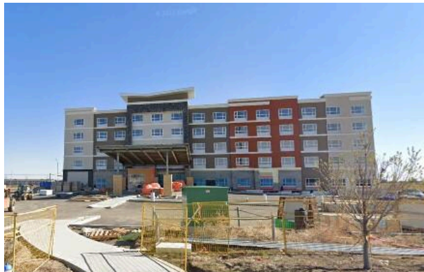
South View of 6125 - ANDREWS LOOP SW - Google Street View - May 2021