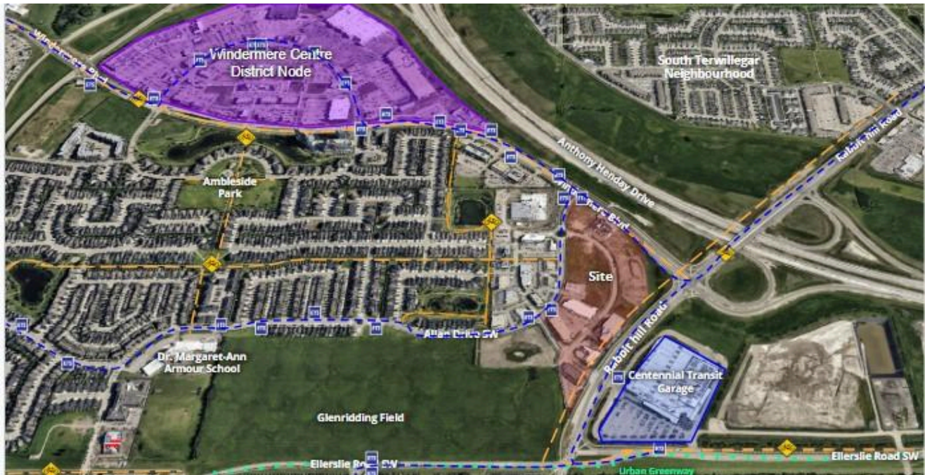
Site analysis context