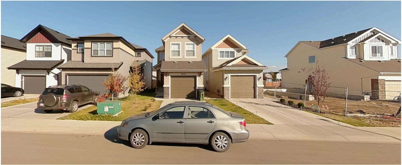
View of the east side of the rezoning area.