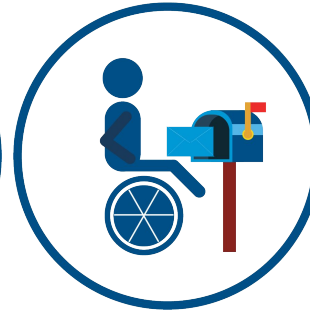
MAILED NOTICE Jan 12, 2025