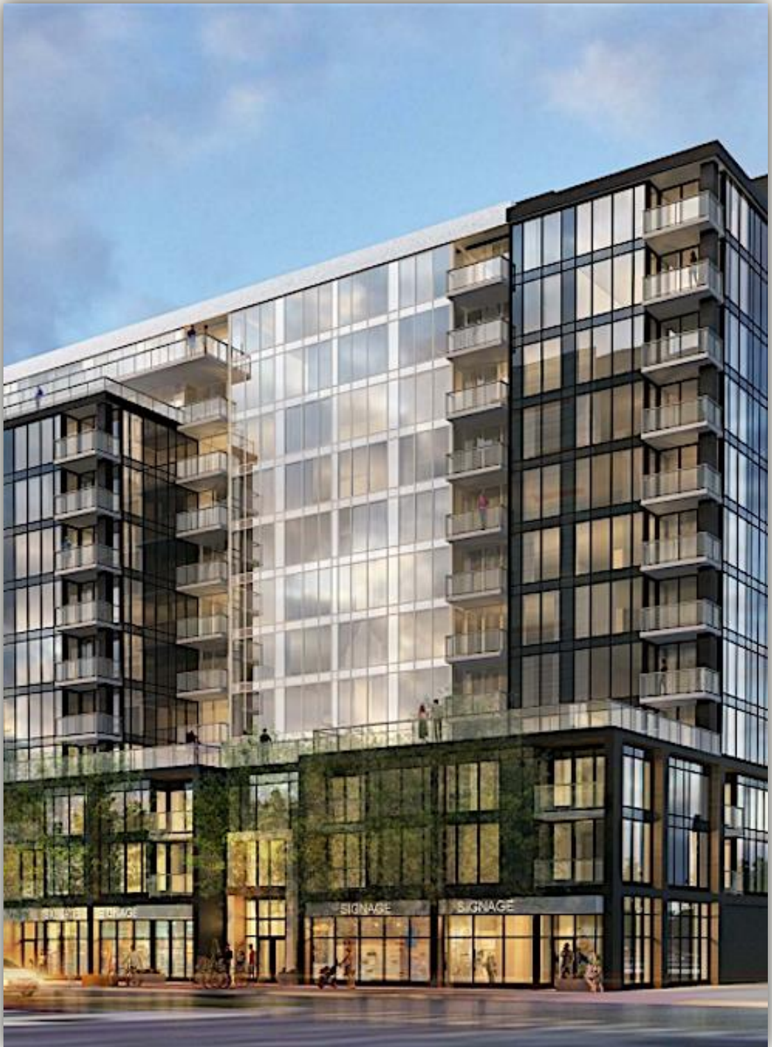
Hat on 122