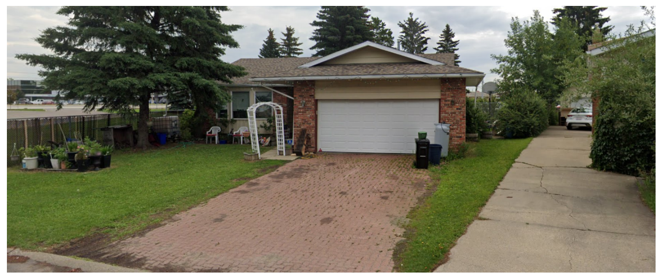
View of the site looking south from 29 Avenue NW (Google Street View Jul 2023)