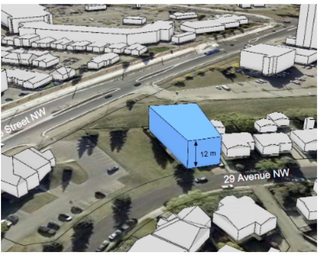
Model #2 - RM h16.0 Zone - 12 m