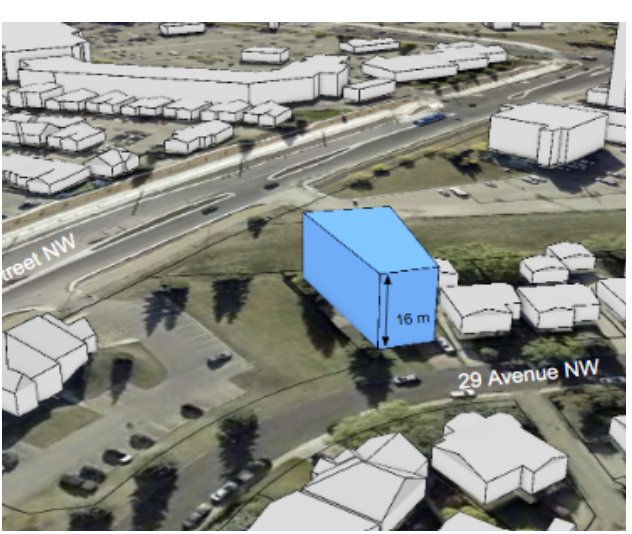
Model #1 - Current RS Zone