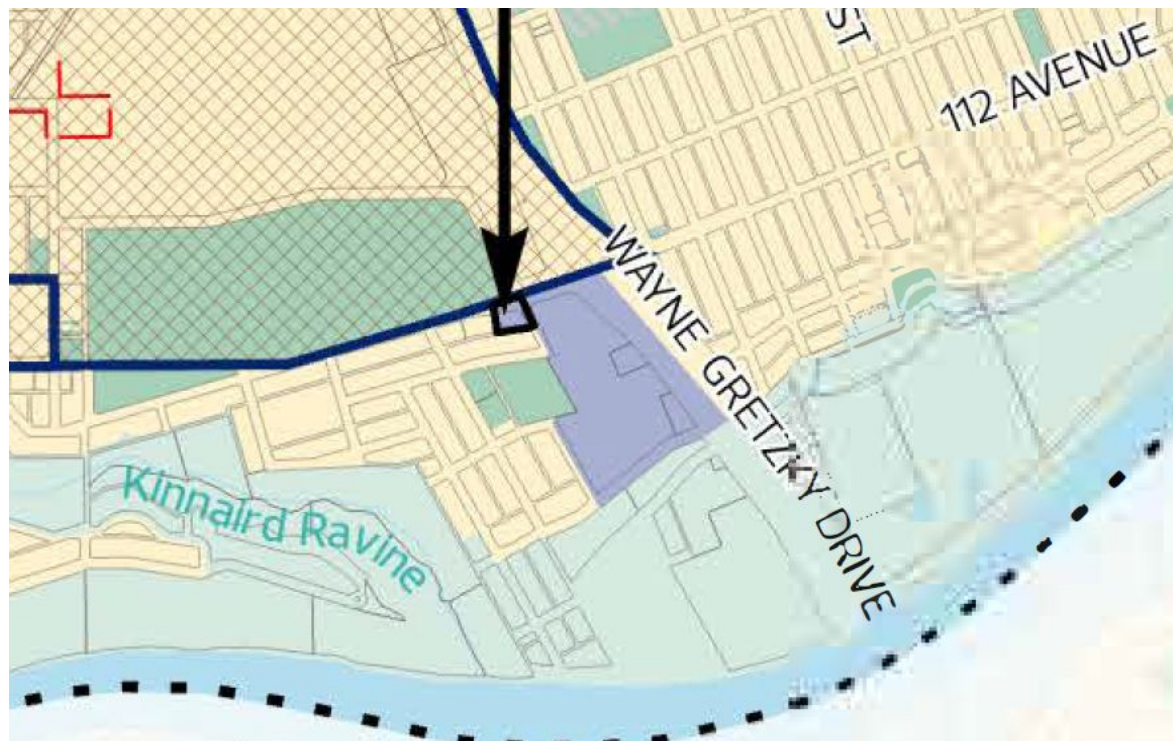
NORTH CENTRAL DISTRICT PLAN