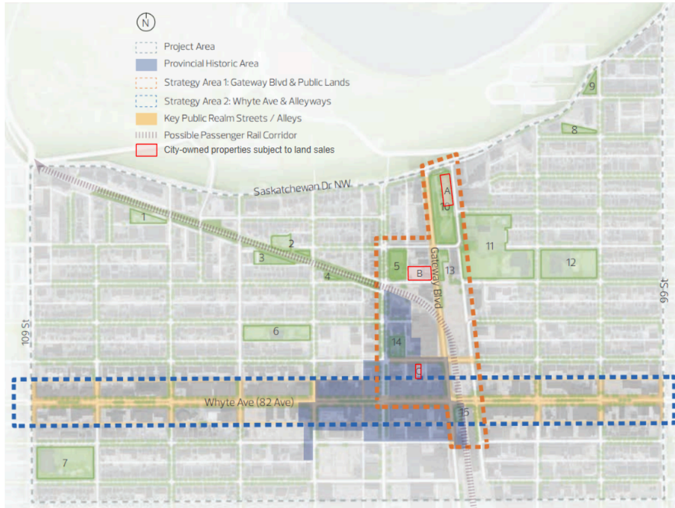
Context map with Old Strathcona Public Realm Strategy boundaries