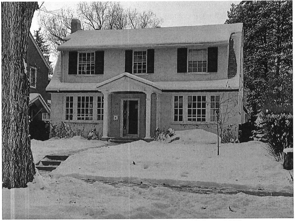
View of front (east) elevation, looking west from 132 Street NW.