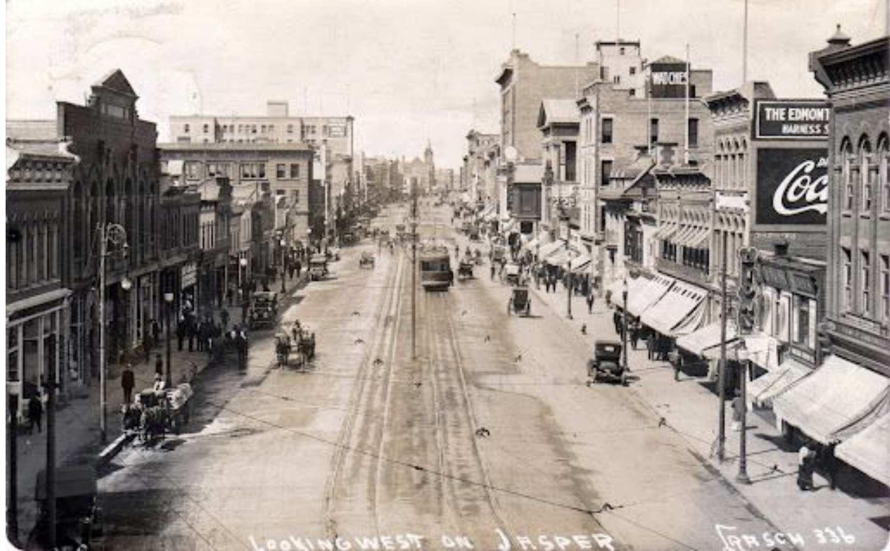
LOOKING WEST ON JASPER