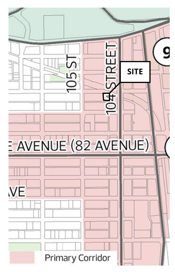
SCONA DISTRICT PLAN - Map 3: Nodes and Corridors