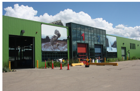
Ambleside Eco Station West Egress