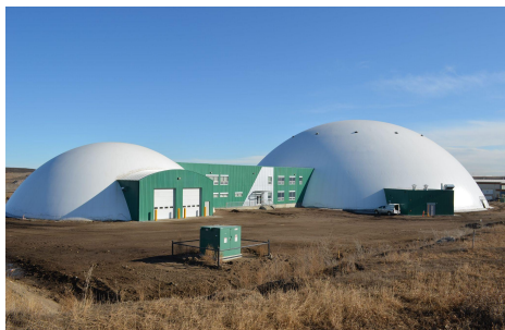
Waste Services Site Paving