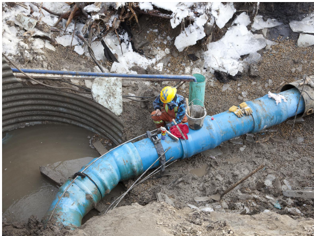
EWMC Water Distribution System Upgrade