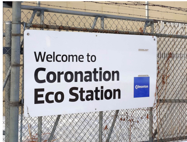
Coronation Eco Station Expansion