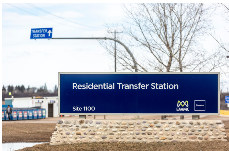
Residential Transfer Station Upgrades