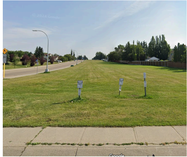
View of sites north of Hillview Crescent