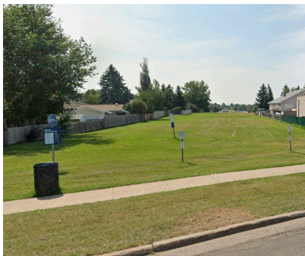
View South from 38 Ave