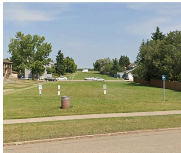
View of sites north of 38 Avenue NW