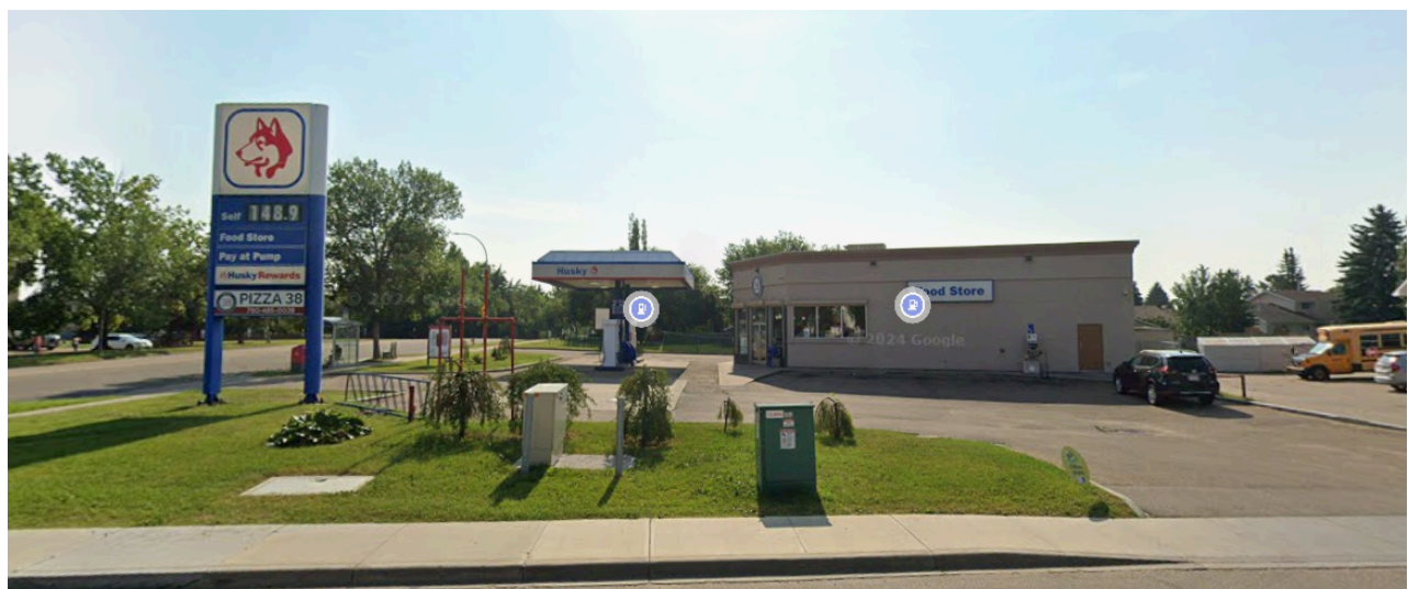
View of proposed DC site east of Woodvale Road E NW (Google Street View Jul 2024)