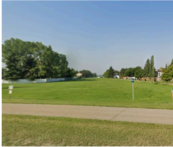
View of sites south of 50 Street NW