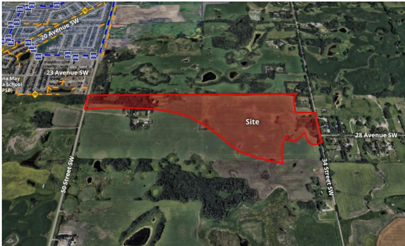
Site analysis context