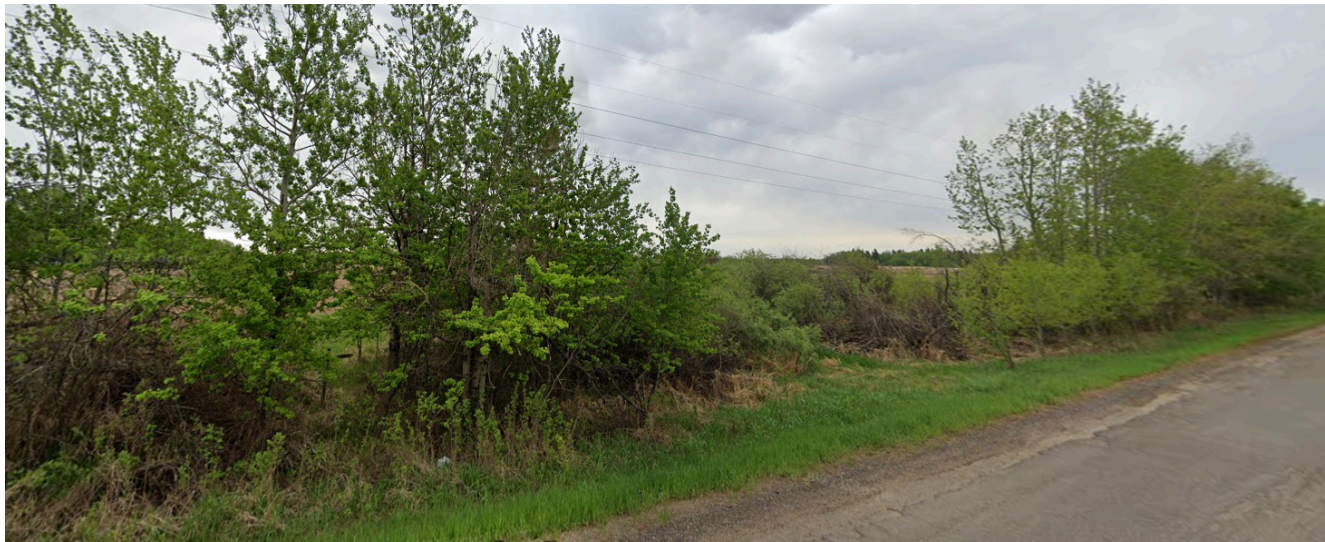
View of the site looking northwest from 34 Street SW