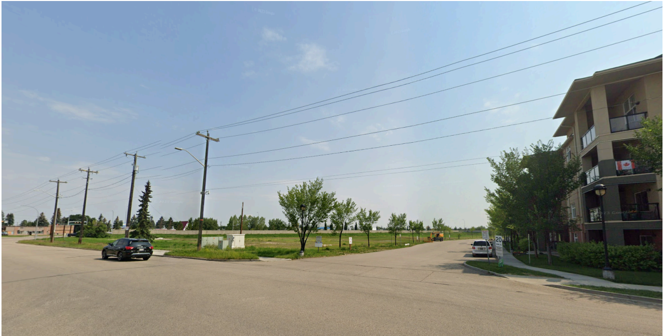
View of the site from the the southwest at the intersection of 71 Street NW and 80 Avenue NW