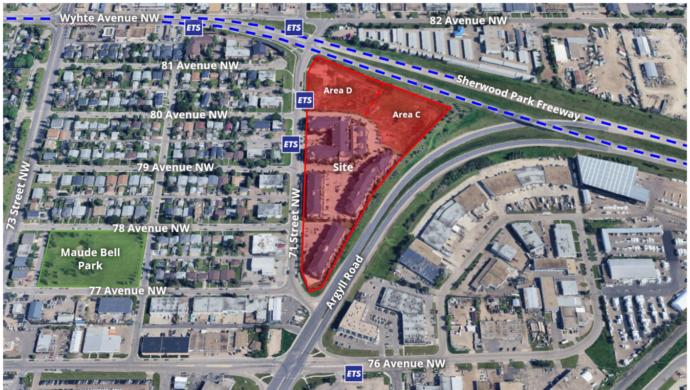
Aerial view of application area