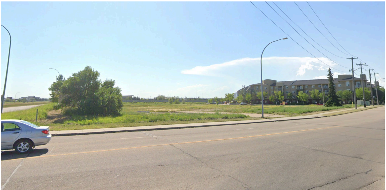
View of the site from the the northwest at the intersection of 71 Street NW and Sherwood Park Freeway NW