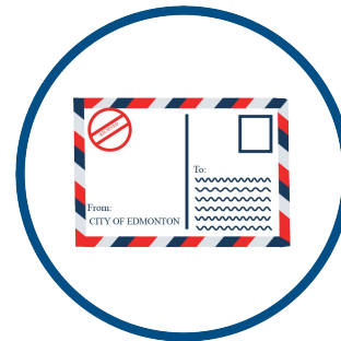
PUBLIC HEARING NOTICE Apr 10, 2025