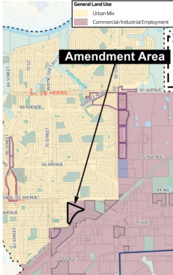
SOUTHEAST DISTRICT PLAN