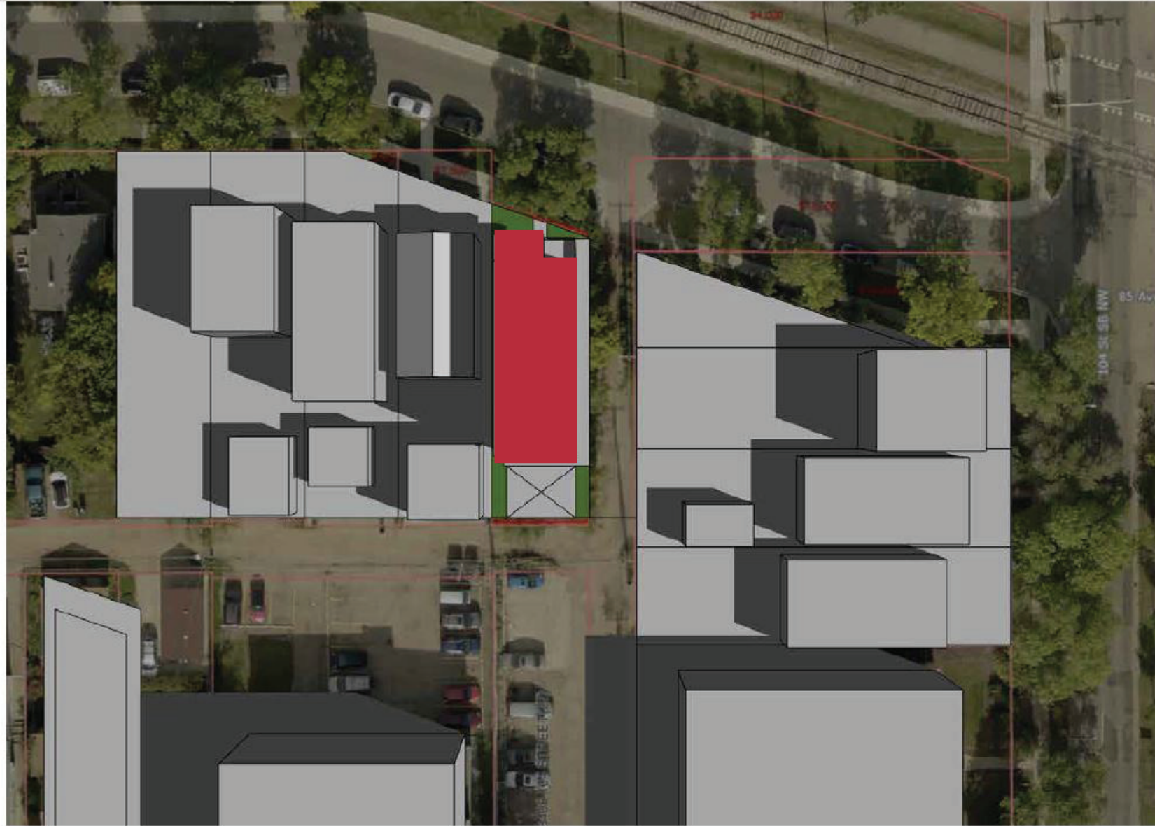
April 23, 2025 - 10am - FULL 14M HEIGHT