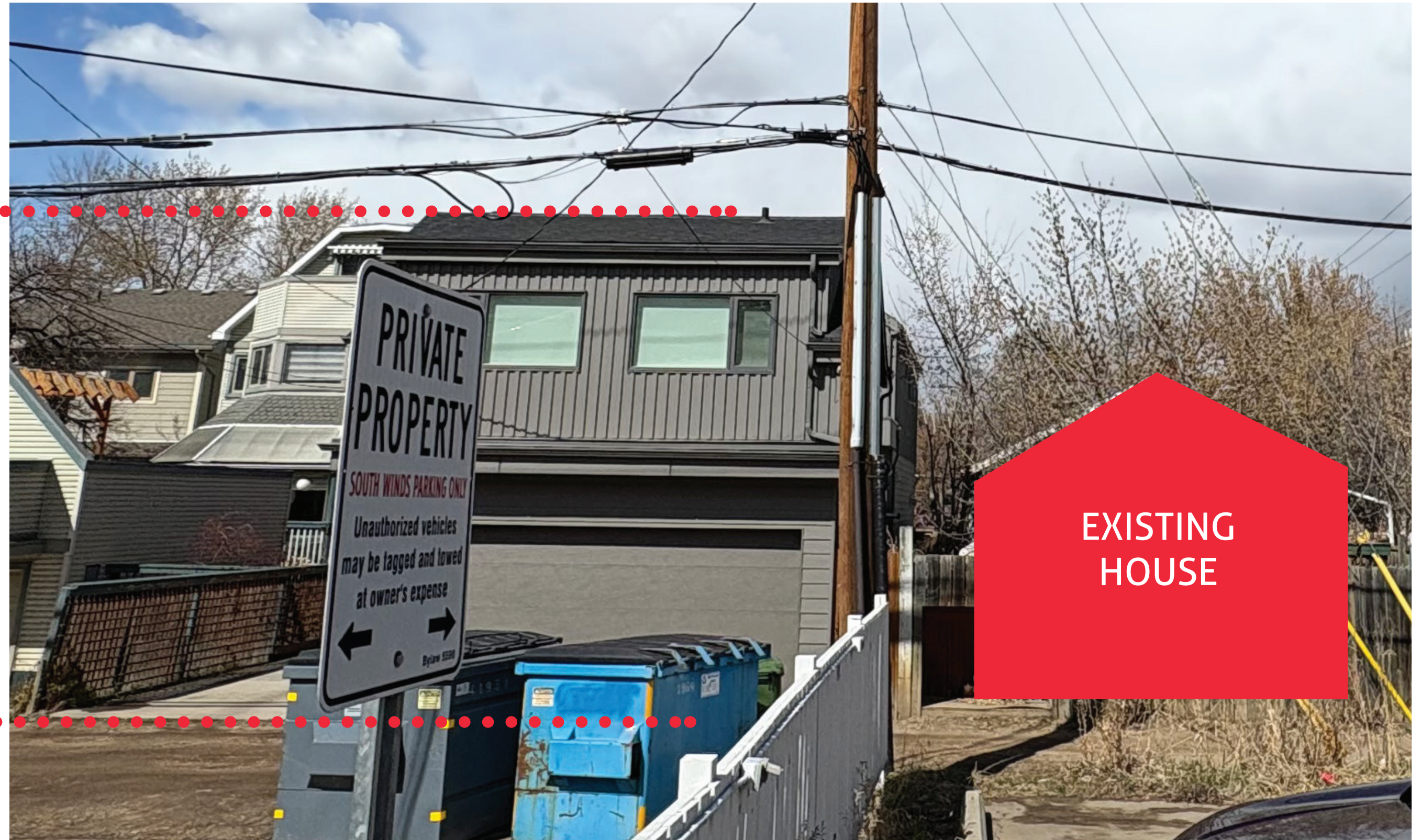
View from Lane looking North