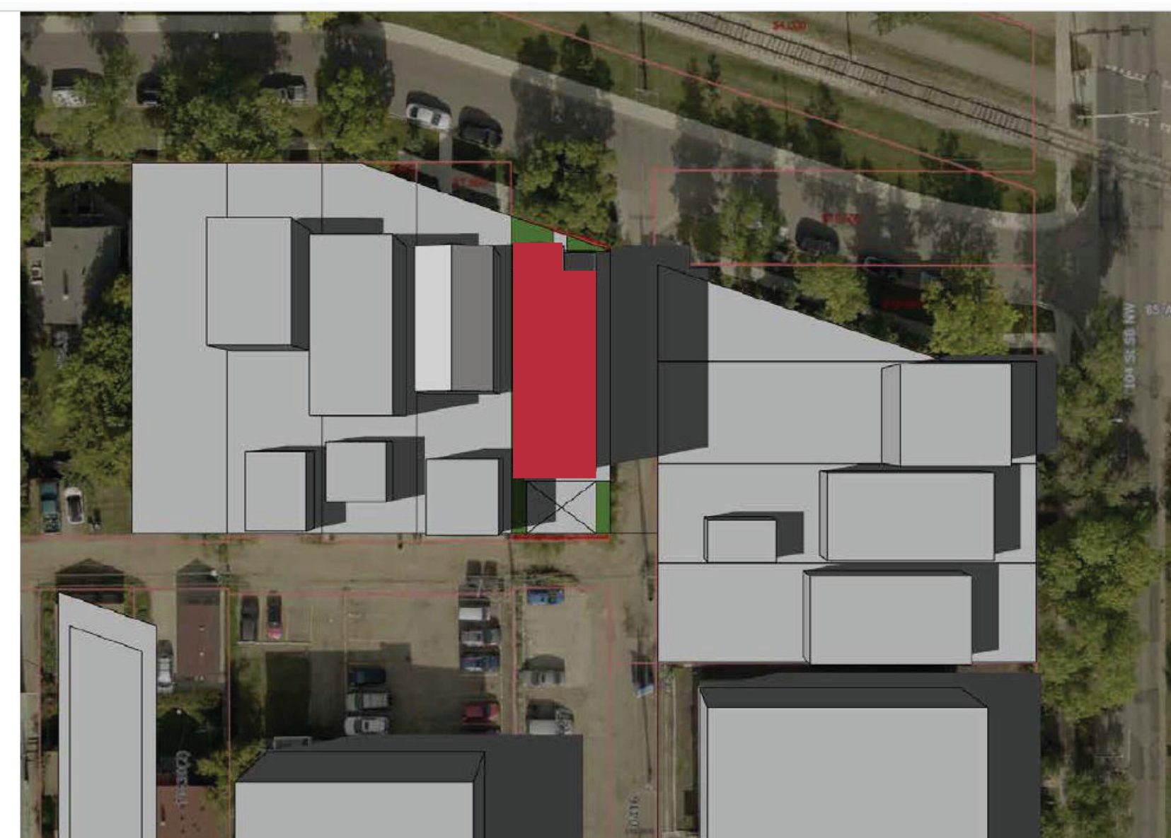
June 22, 2025 - 4pm - FULL 14M HEIGHT