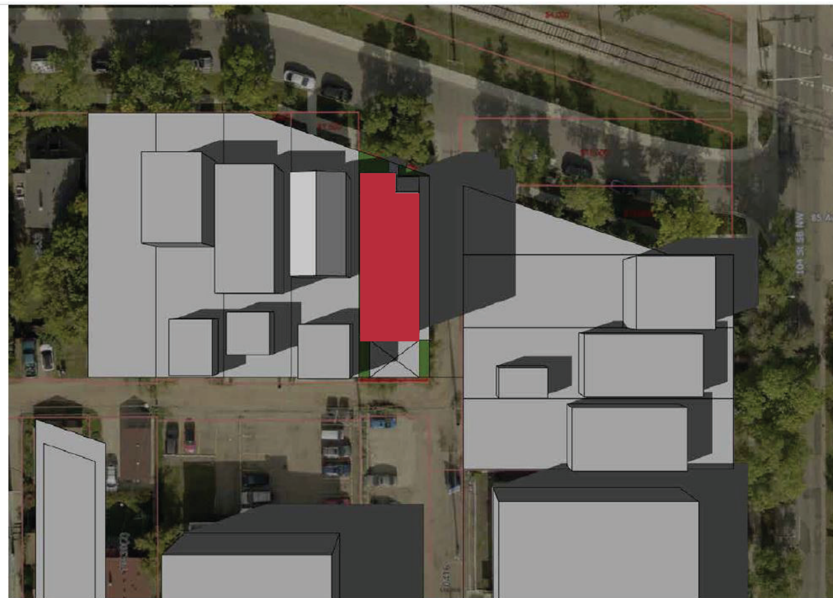
April 23, 2025 - 4pm - FULL 14M HEIGHT