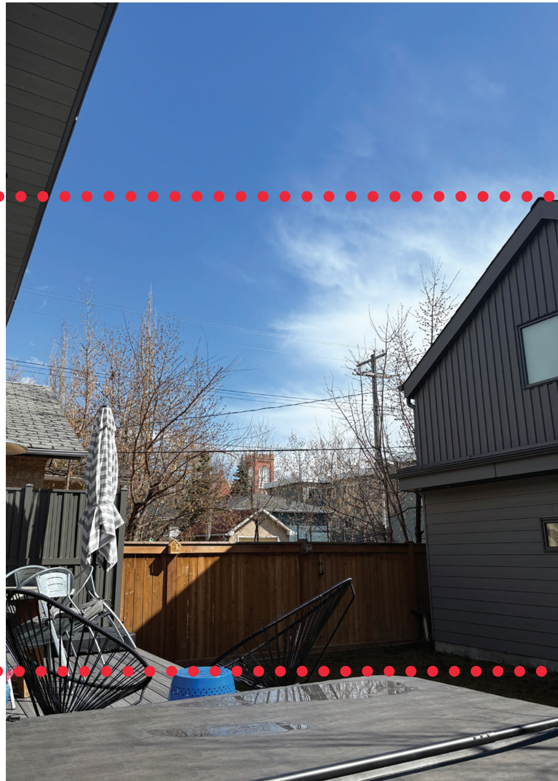
View from West Neighbour Yard