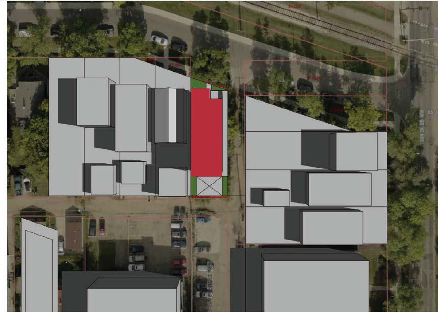
June 22, 2025 - 10am - FULL 14M HEIGHT