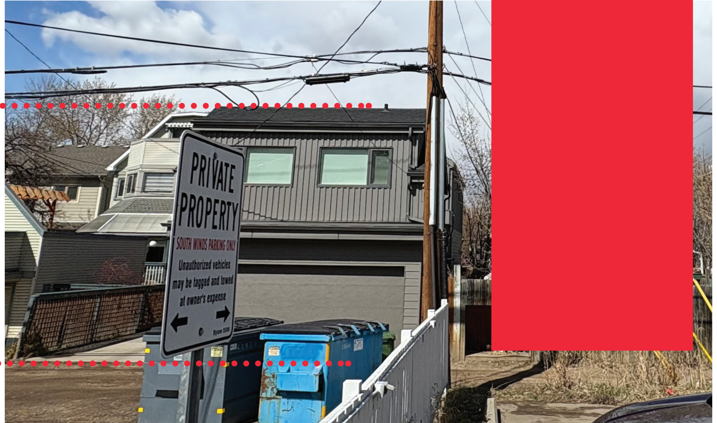
View from Lane looking North