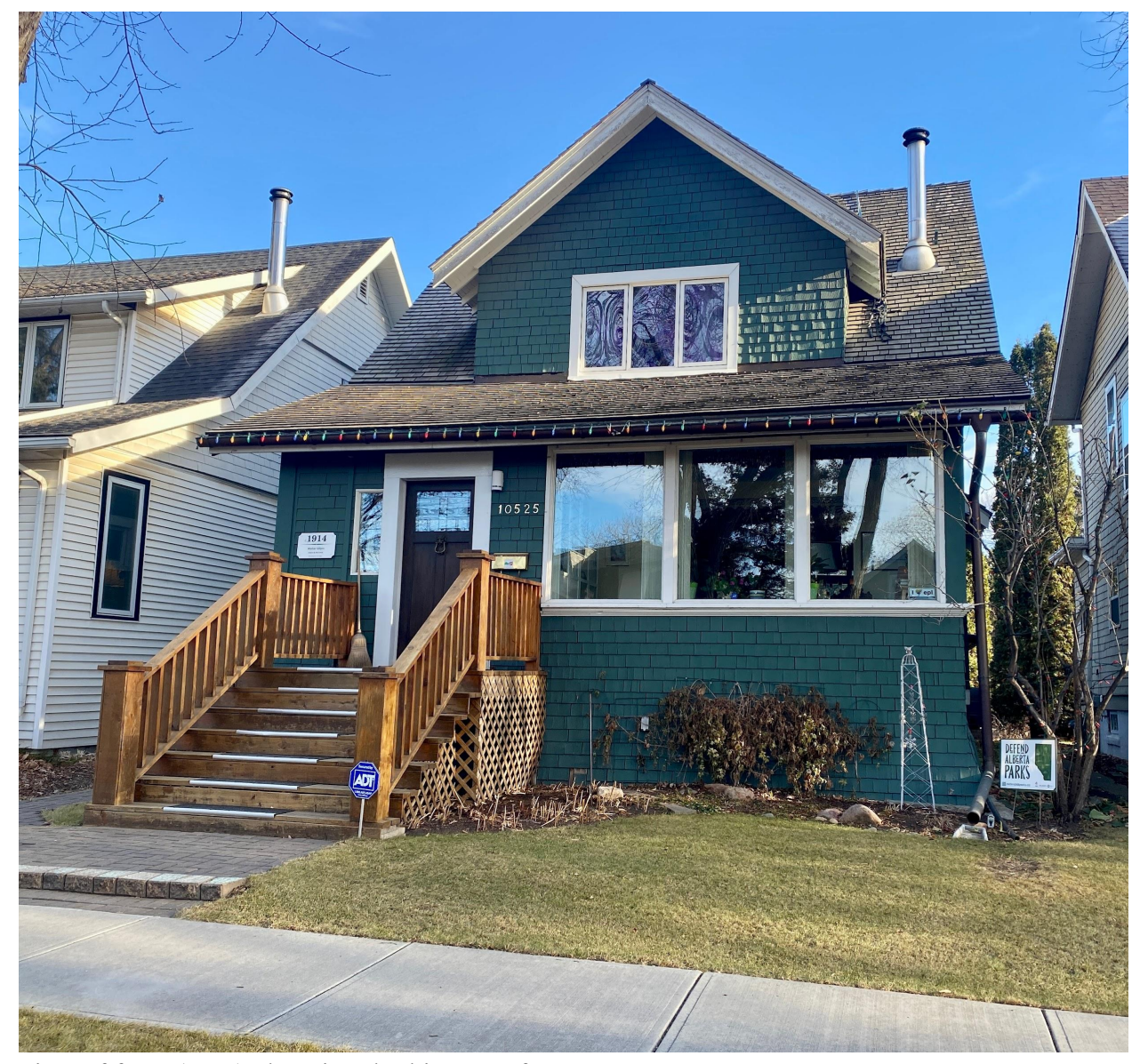
View of front (west) elevation, looking east from 129 Street NW.