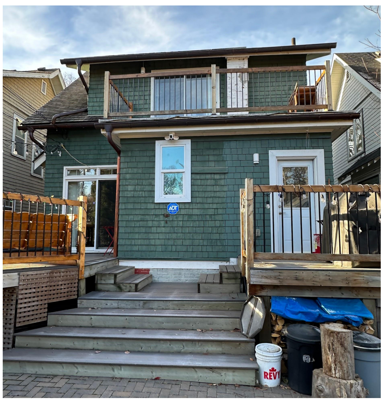
View of rear (east) elevation, looking west from property rear yard.