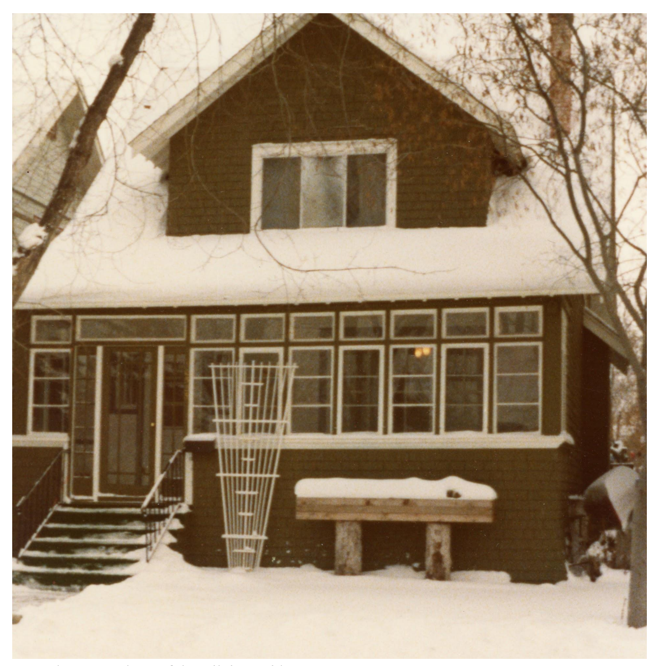
December 1980 photo of the Gilpin Residence.