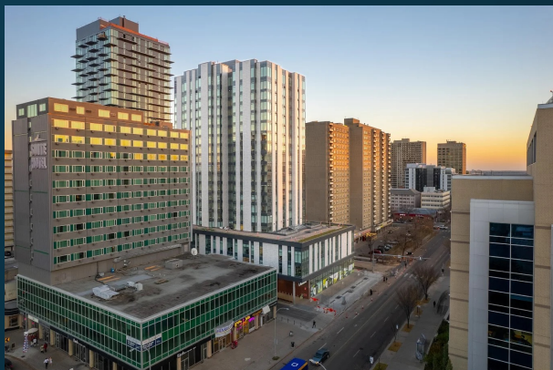
City Plan Vision