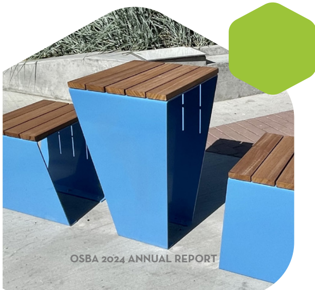
OSBA 2024 ANNUAL REPORT

Along with the successes, the completion of this project also provided us learning opportunities. As we’ve never owned permanent furniture before, we needed to establish a schedule for cleaning, maintenance, and repairs. We contracted social enterprise Hire Good to provide snow and graffiti removal and litter pickup, cleaning the parklets an average of three days per week and employing eight people. Next year, after we’ve had the street furniture for a full year, we will create a strategy that outlines the procedure, schedule, and budget required for maintenance and repairs.