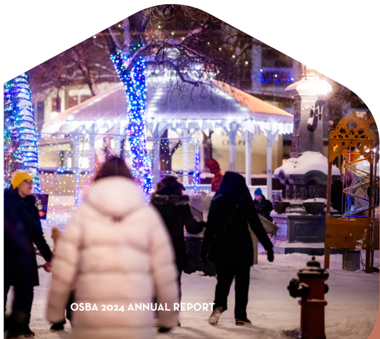
OSBA 2024 ANNUAL REPORT