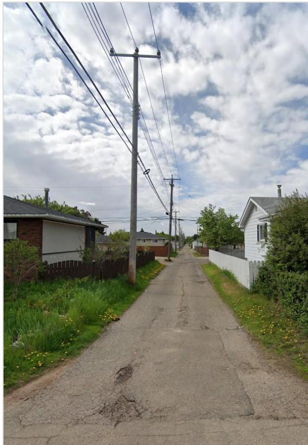
Road Closure Area "B"