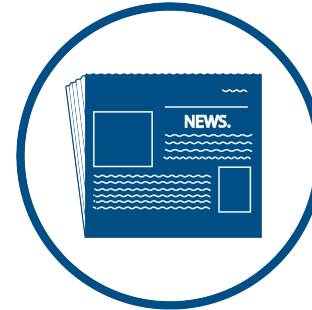
JOURNAL AD Apr 17 + 26 & May 23 +31, 2025