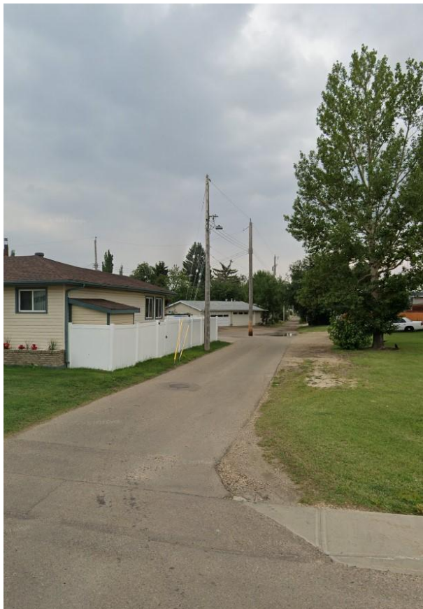
Road Closure Area "A"