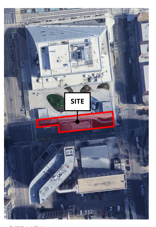
CITY PLAN CENTRAL DISTRICT PLAN