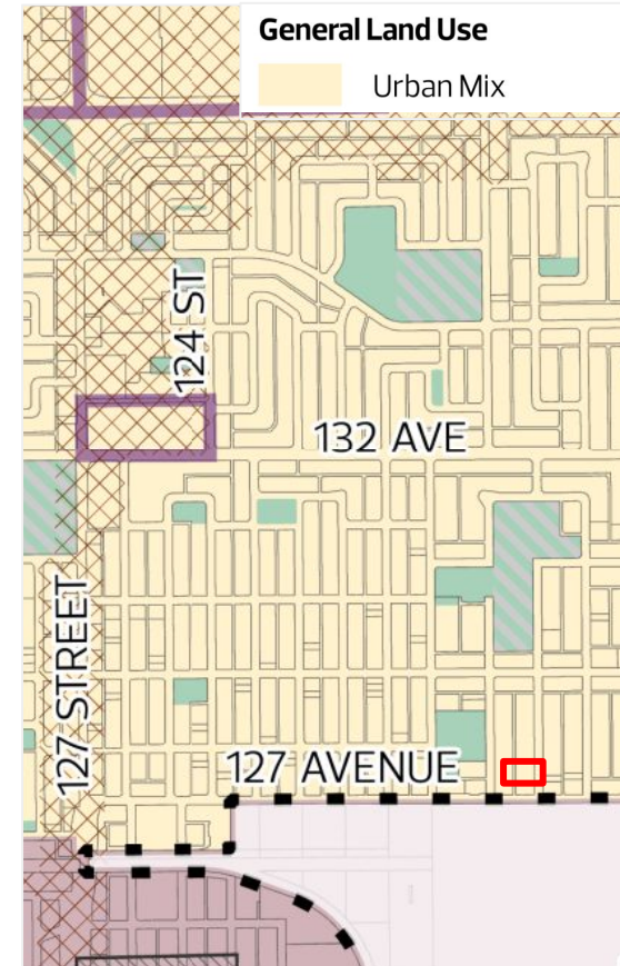
NORTHWEST DISTRICT PLAN Nodes and Corridors