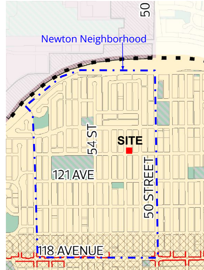
North Central District Plan Map 4: Land use Concept to 1.25 Million