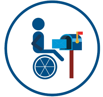
MAILED NOTICE January 21, 2024