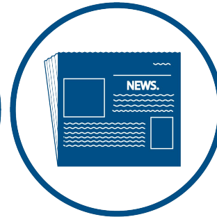
JOURNAL AD May 23 & 31, 2025