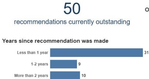
Outstanding Recommendation Distribution