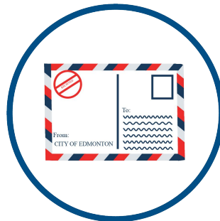
PUBLIC HEARING NOTICE June 5, 2025