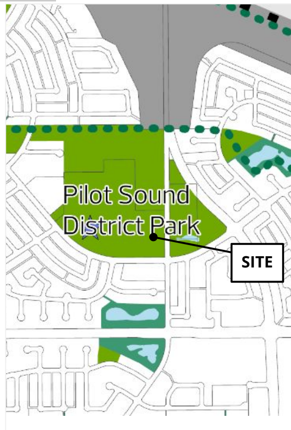
Northeast District Plan Map 5: Open Space & Natural Areas