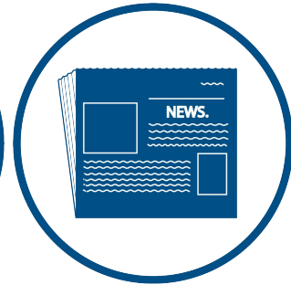
JOURNAL AD May 23 and 31, 2025