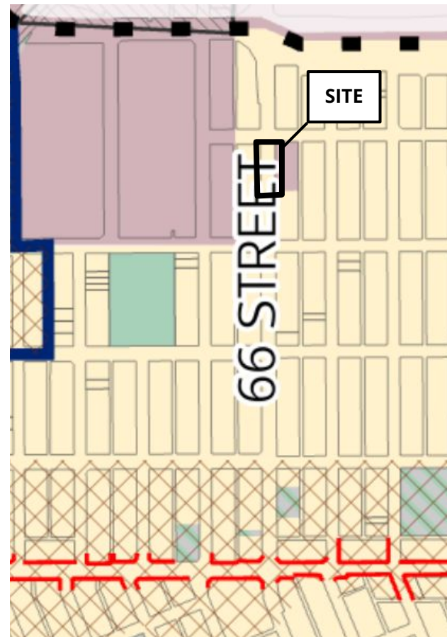
PROPOSED 'COMMERCIAL/INDUSTRIAL EMPLOYMENT' LAND USE