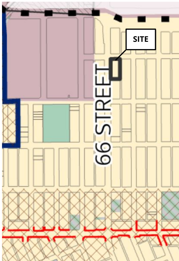
EXISTING 'URBAN MIX' LAND USE