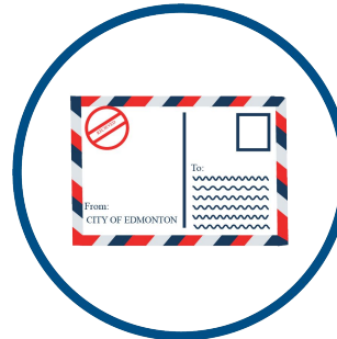
PUBLIC HEARING NOTICE Jul 24, 2025