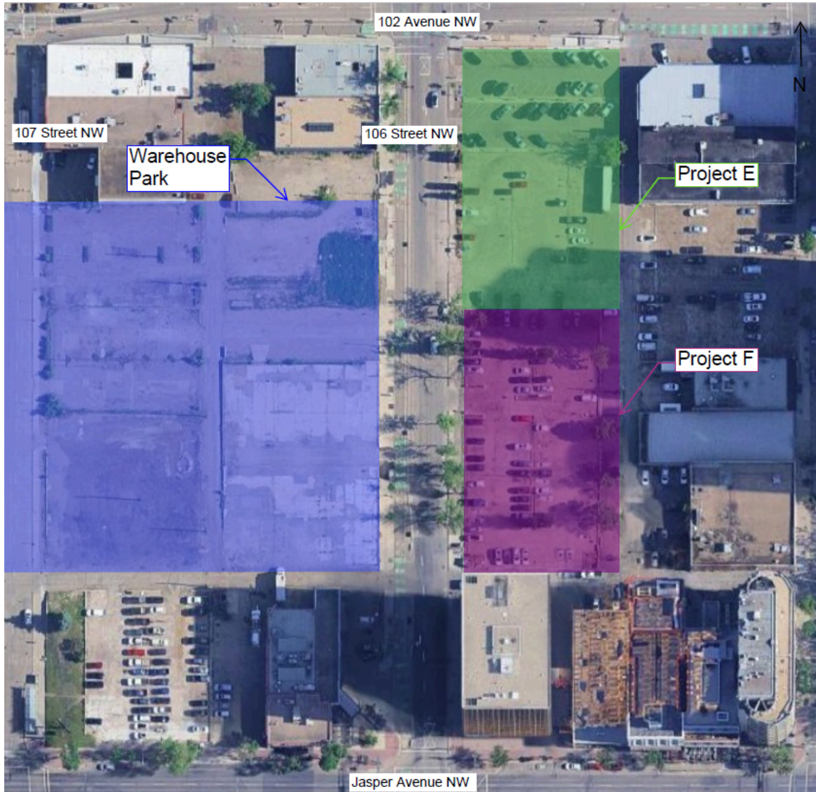
Figure 2: Location of developments benefiting from 106 Street upgrades

There are two residential developments located on 106 Street that will benefit from the 106 Street electrical upgrade project. The residential developments are shown in Figure 2 below (Development Projects E and F). There are a total of 375 anticipated dwelling units among these two developments.