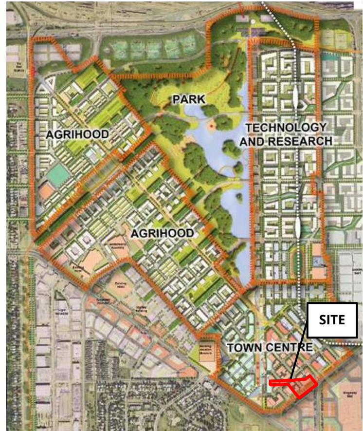
CENTRE CITY ARP