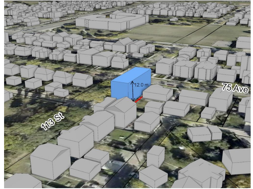
PROPOSED: RSM h12.0 Zone