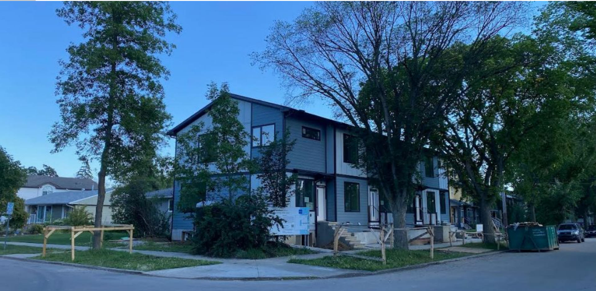
View if the site looking southeast