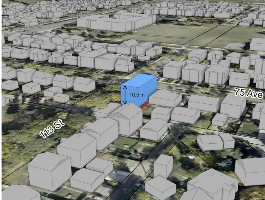
CURRENT: RS Zone