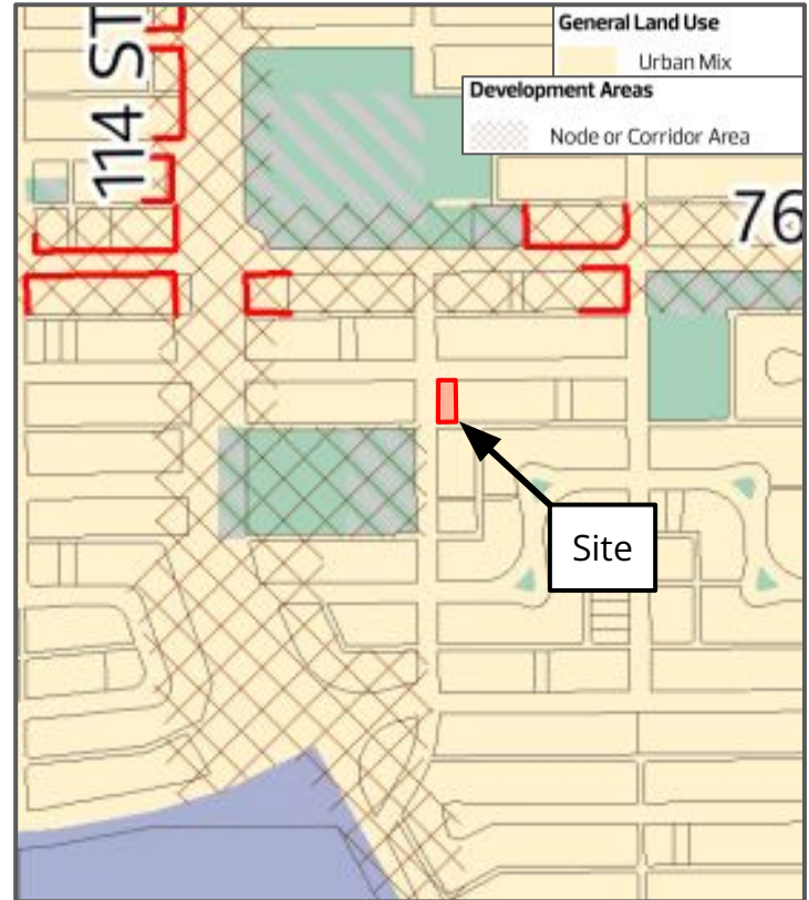
Scona District Plan