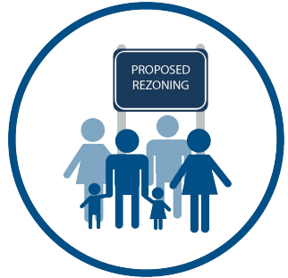
SITE SIGNAGE Aug 21, 2025