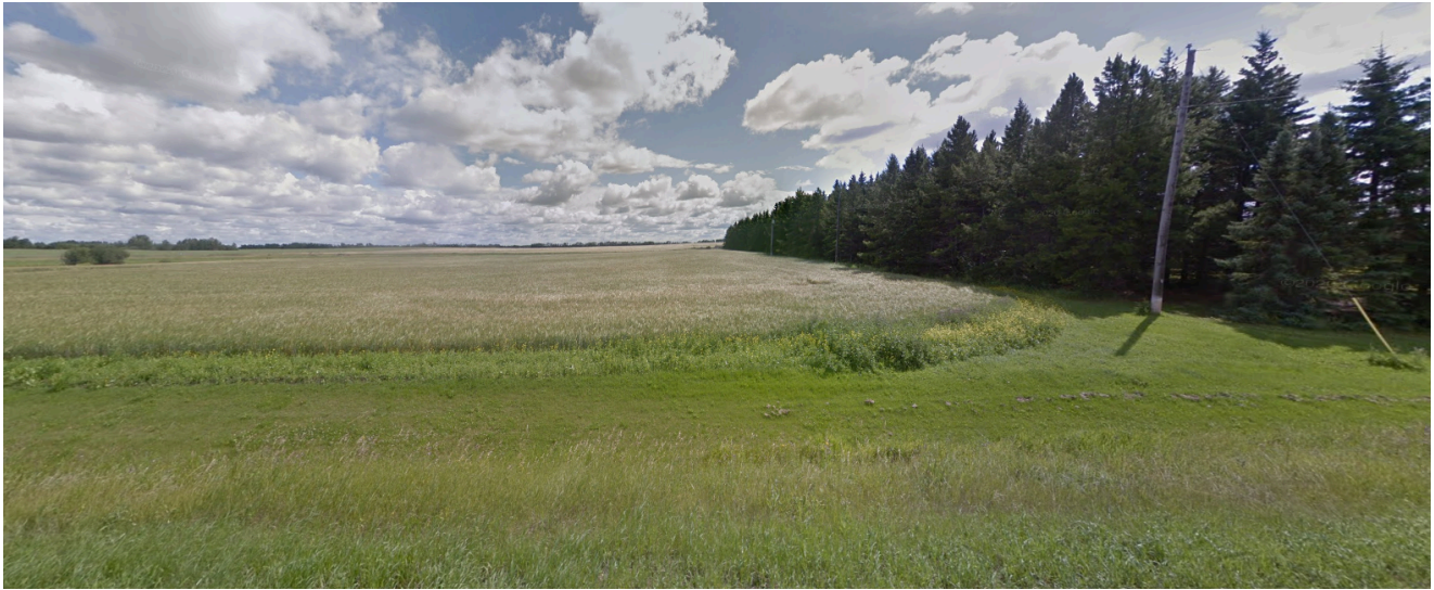
View of the site looking east from 184 Street SW