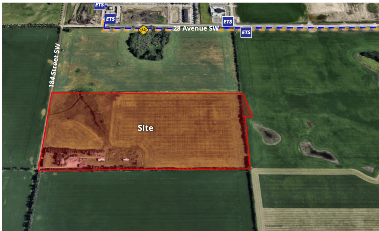
Site analysis context