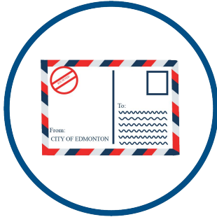
PUBLIC HEARING NOTICE Oct 23, 2025