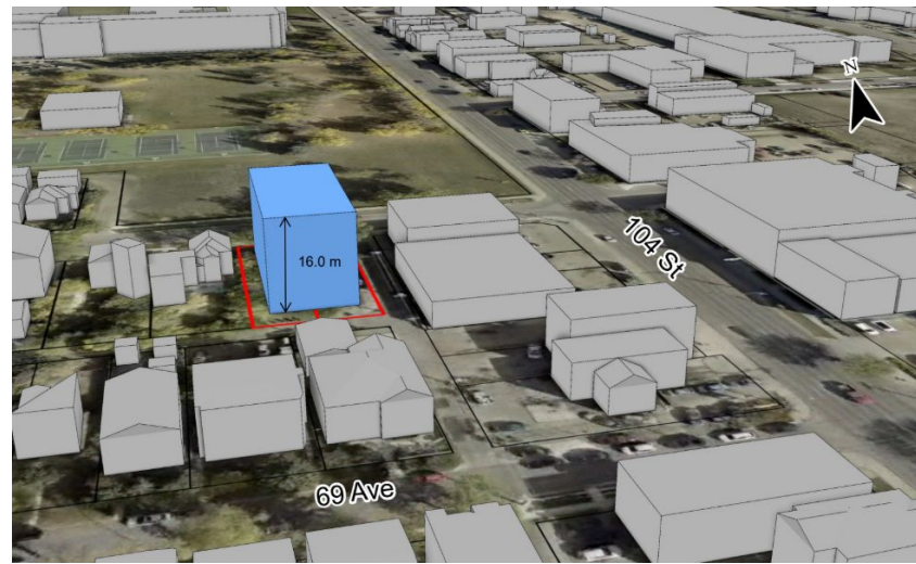
PROPOSED: RM h16.0 Zone