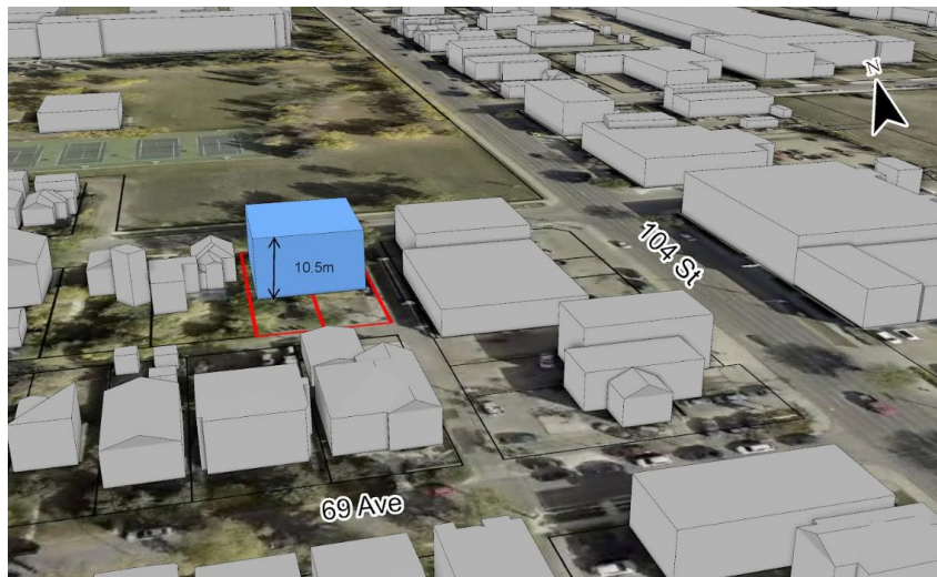
CURRENT: RS Zone