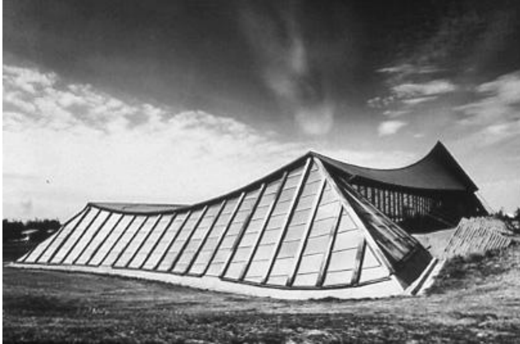
View of east elevation, shortly after completion, circa 1970.