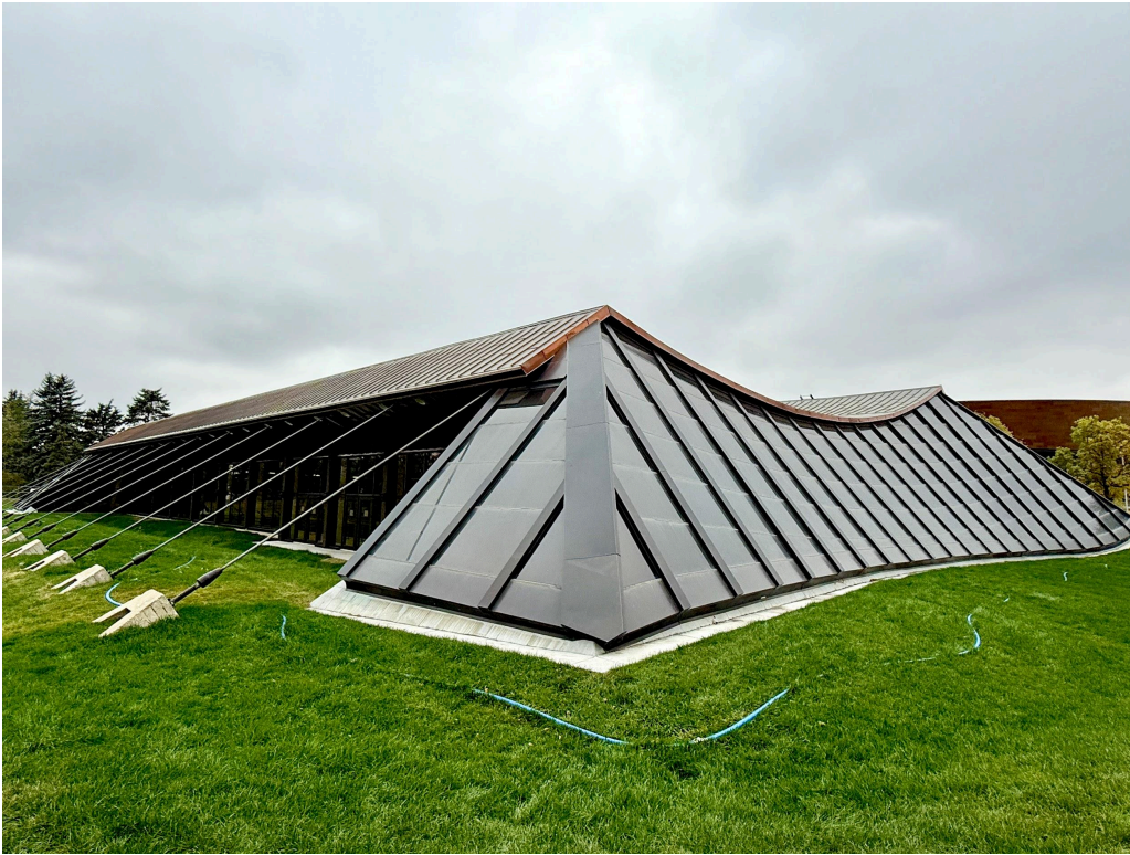
View of south (at left) and east (at right) elevations, looking northwest.