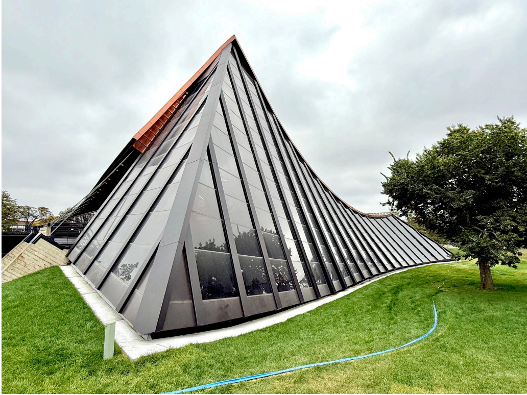
View of west (at right) and north (at left) elevations, looking southeast.