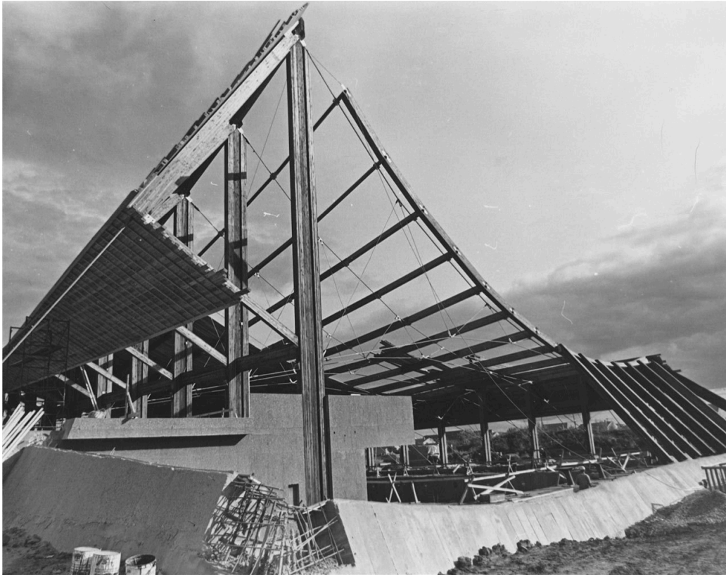
View of west elevation during construction, circa 1969.