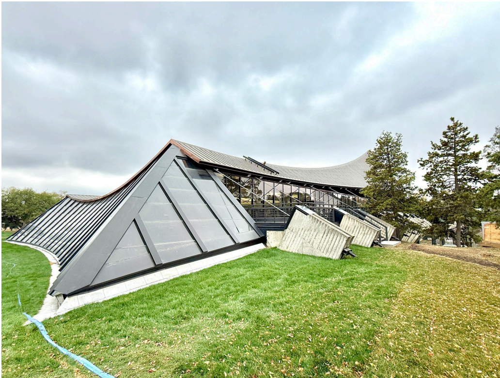
View of north elevation, looking southwest.