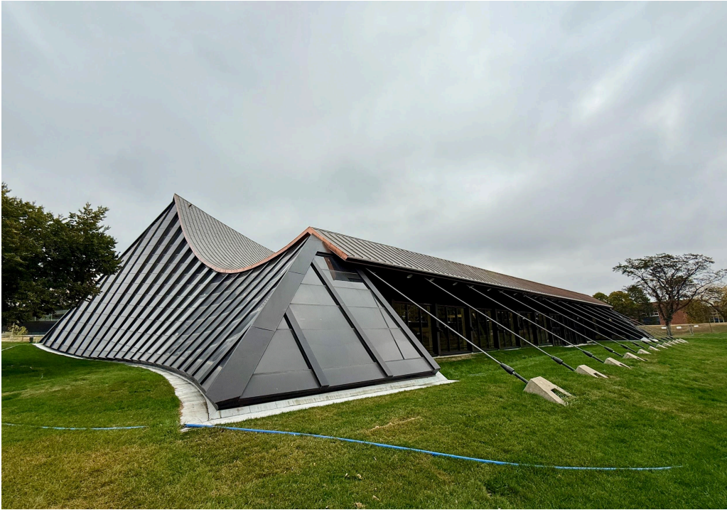
View of south (at right) and west (at left) elevations, looking northeast.