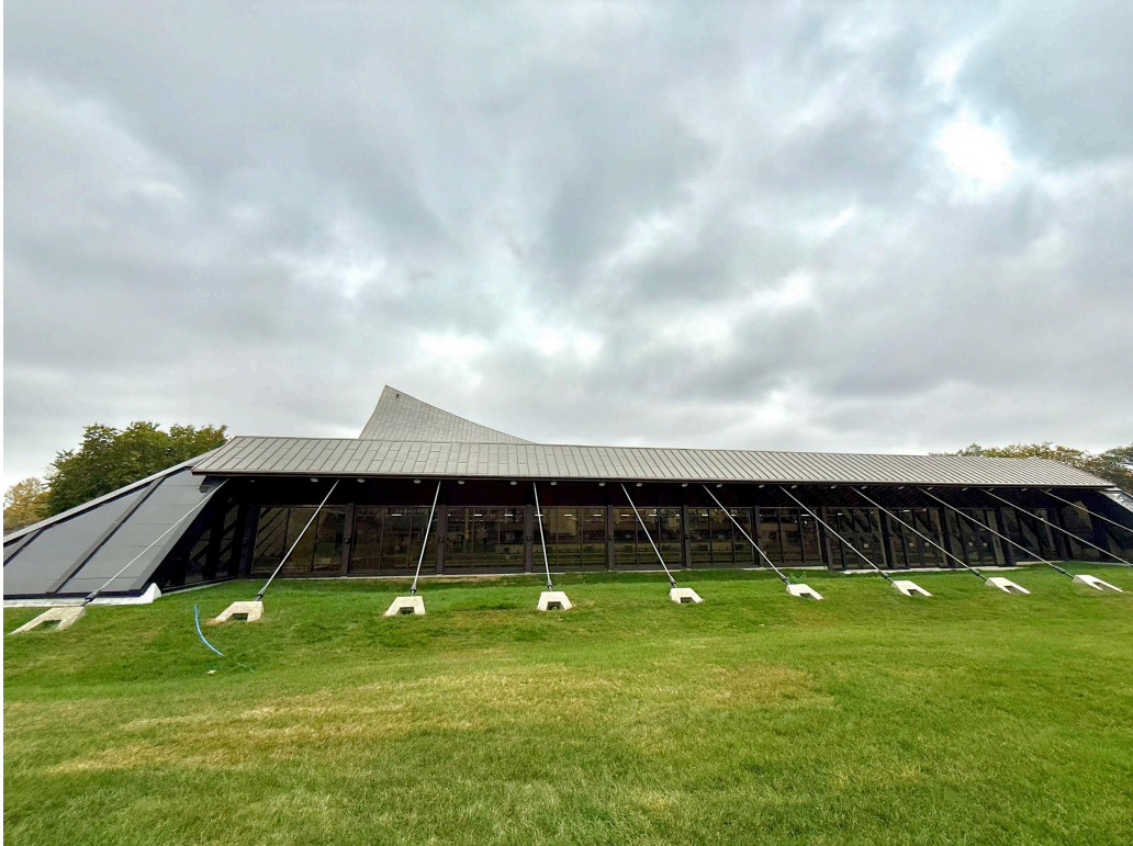
View of south elevation, looking north.