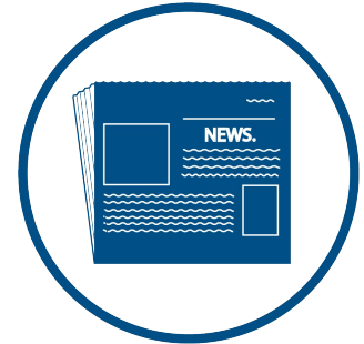
JOURNAL AD Jan 16 & 24, 2026