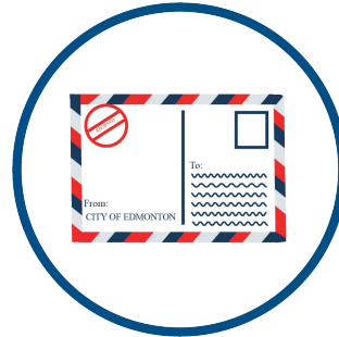
PUBLIC HEARING NOTICE Jan 8, 2026