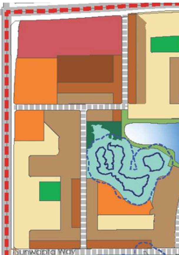
CURRENT STILLWATER NSP